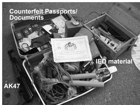
Captured insurgent material. 2BCT learned the hard way that it's not enough merely to seize evidence. Contraband must be properly handled and documented to aid in insurgent prosecution.

We discovered that identifying and training an informant was a complex and time-consuming process. Finding the right type of individual willing to work with you is both an art and a science. Our counterintelligence-trained Soldiers were instrumental in ensuring that we worked with the most reliable, most