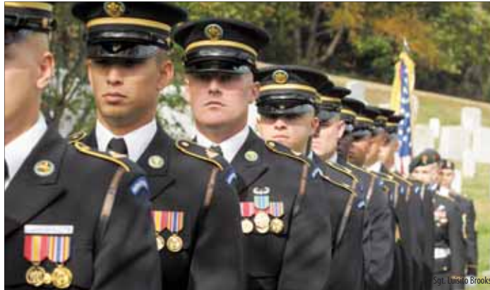
Soldiers from Honor Guard Company, 3d U.S. Infantry Regiment (The Old Guard) and the U.S. Army Special Forces Command stand in formation prior to the start of a wreath laying ceremony, Oct. 18, at the John F. Kennedy gravesite in Arlington National Cemetery, Va. Special Forces Soldiers also lay a wreath at the memorial on Kennedy's birthday (May 29.)