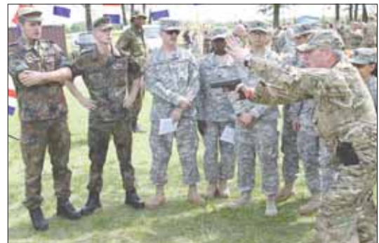
Soldiers from the 557th Area Support Medical Company and German soldiers receive a handling course on the Glock 17 pistol from a British non-commissioned officer during the 29th Annual Monte Kali Pokal shooting competition at Wackernheim Regional Range, May 11.

Some military members used the opportunity to famil-