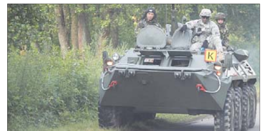
Lt. Col. Vladimir Skorostetskiy

our ARMY around the world For more Army news, visit www.army.mil