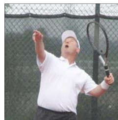
Tennis players serve it up during the U.S. Forces Europe Tennis Championships held at Patrick Henry Village in Heidelberg July 20-21.