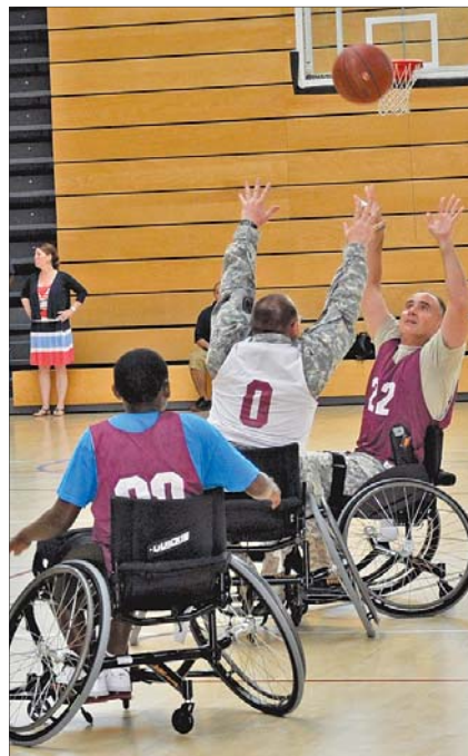
Members of the Warrior Transition Unit-Europe play wheelchair basketball at the Wiesbaden Fitness Center July 6.

After the competition, the Soldiers gathered together for a barbecue.