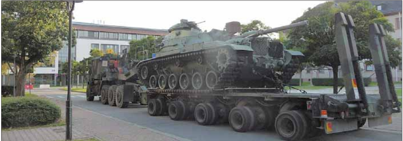
Lt. Col. David Laffam

The M-60 tank is moved by members of the 6966th Transportation Truck Terminal Company, 21st Theater Sustainment Command, Sept. 26 from its location in front of V Corps Headquarters in Heidelberg to Kaiserslautern where it will be refurbished and painted before moving to Wiesbaden, the new home of V Corps. The tank's turret had been securely sealed while on display and welders had to unseal it. The tank was also inspected to ensure no radiological material existed in the panel instruments. German laws require at least 30 days road clearance and a special truck and cranes were used to lift the tank and to allow it to pass under bridges and along roads.