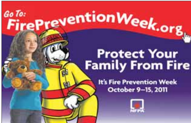
The photo at right shows a kitchen in Bldg. 676 on Patrick Henry Village in Heidelberg following a fire caused by unattended cooking, the reason for 60 percent of fires in Army family housing units. The photo at left shows the National Fire Protection Association's prevention poster.

“With responsible use of fire indoors and outdoors – from safely disposing of matches and cigarettes to increased attention when cooking – we can avoid untold numbers of emergencies, injuries and lives lost to fire and its consequences,” Eberlein said.