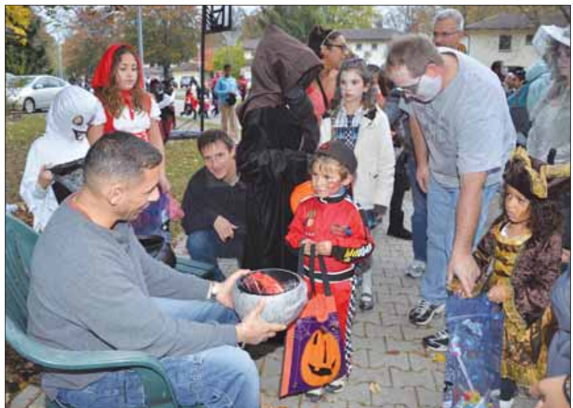
Hundreds of costumed children and adults turn out for Trick or Treat on Patrick Henry Village in Heidelberg Saturday.