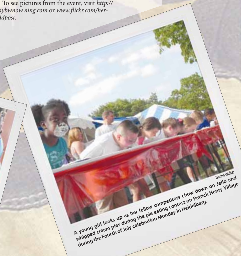
A young girl looks up as her fellow competitors chow down on Jello and whipped cream pies during the pie eating contest on Patrick Henry Village during the Fourth of July celebration Monday in Heidelberg.