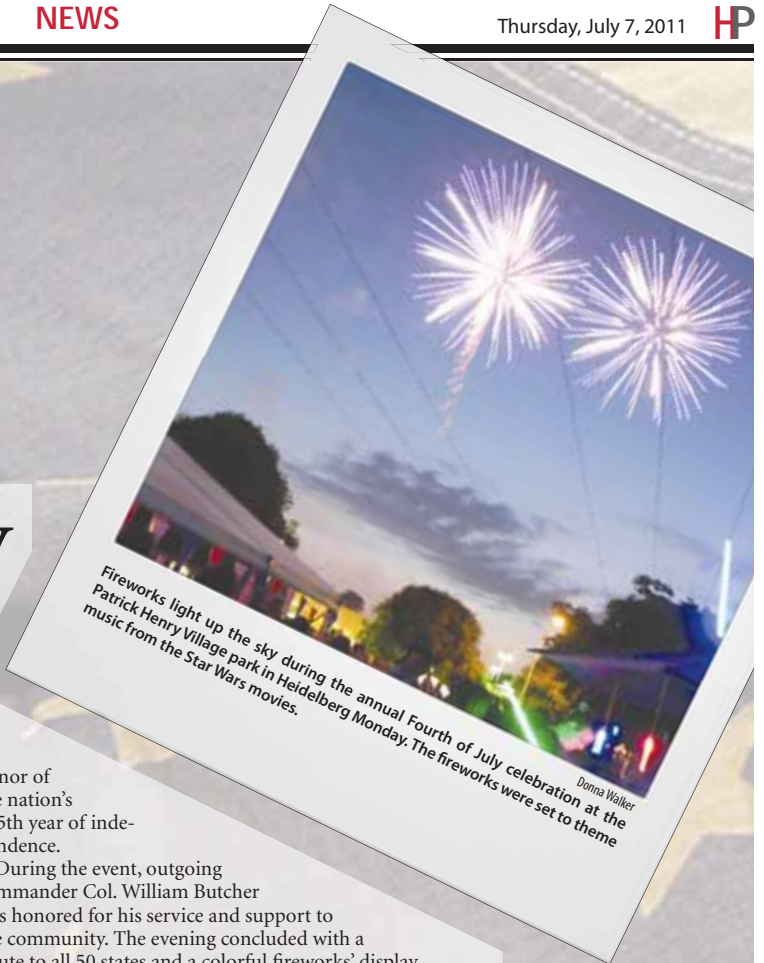
Fireworks light up the sky during the annual Fourth of July celebration at the Patrick Henry Village park in Heidelberg Monday. The fireworks were set to theme music from the Star Wars movies.

To see pictures from the event, visit http://mybwnow.ning.com or www.flickr.com/heraldpost .