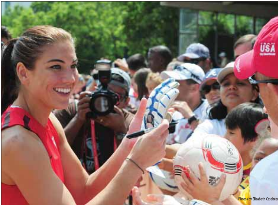
Above, Hope Solo, a goalkeeper for the U.S. Women's National Soccer Team, signs autographs for servicemembers and family members during the team's training day at SG Kirchheim stadium in Heidelberg June 30. Solo was named Women's Professional Soccer Goalkeeper of the Year in 2009.