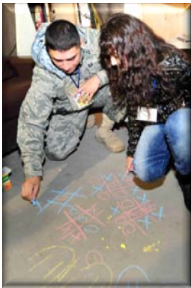
Friends & Family Day at the Transit Center