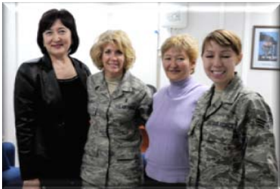
Congress of Women friendship is growing strong