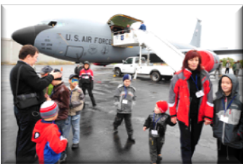
Families and friends visit a KC-135 Air Refueling aircraft to learn more about the Transit Center's mission

We started by making our Kyrgyz employees and