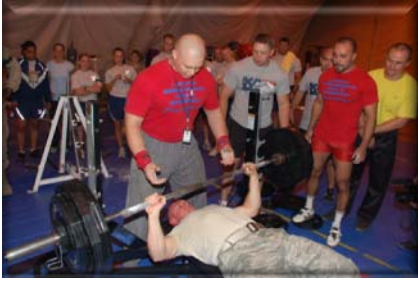
Strong men from Kyrgyzstan compete at the Transit Center