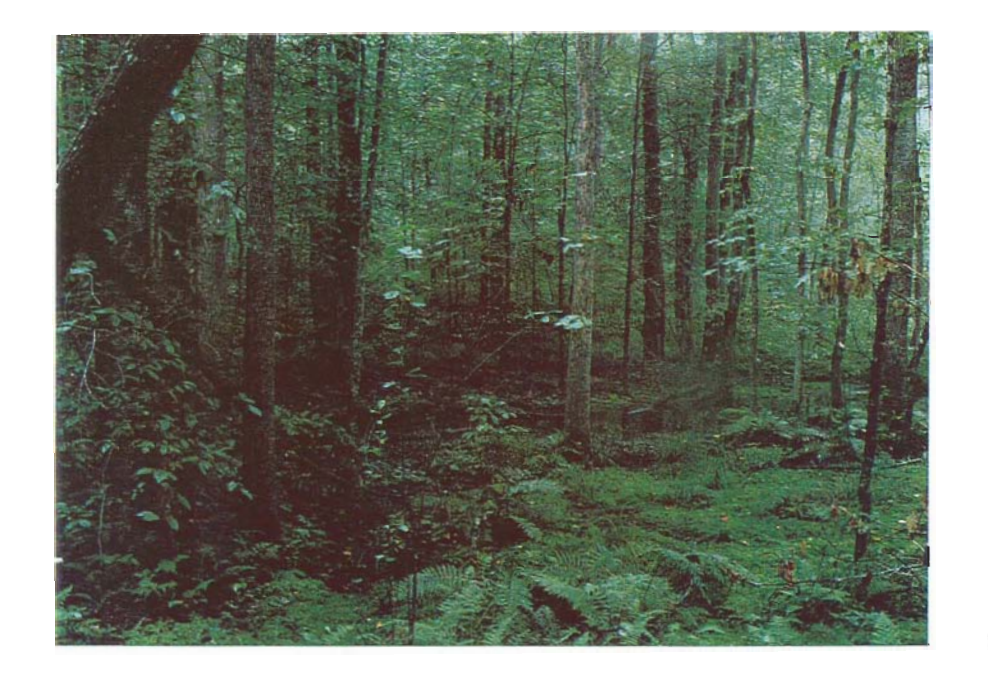
Figure 6. Forested wetland on the ORR.

The ORR is known to be both a reservoir and source for several species whose young leave the reservation. These include white-tail deer (Odocoileus virginianus) (Story and Kitchings 1982), bobcat (Lynx rufus) (Kitchings and Story 1979), fox (Vulpes sp.) (Greenberg and others 1988), osprey, and great blue heron. American wild turkey (Meleagris gallopavo), which were introduced to the ORR in 1986 and 1987 (Minser and others 1992), have been so successful that they are now trapped and