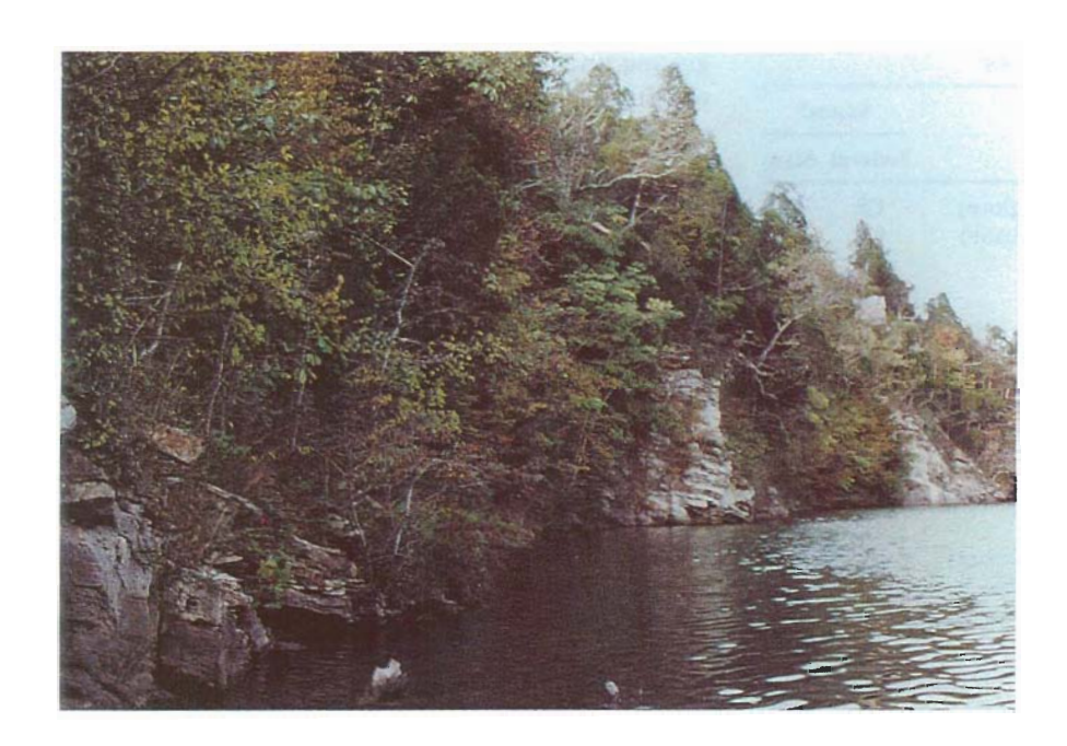
Figure 5. Rocky slope and limestone bluff on the ORR adjoining Melton Hill Lake.