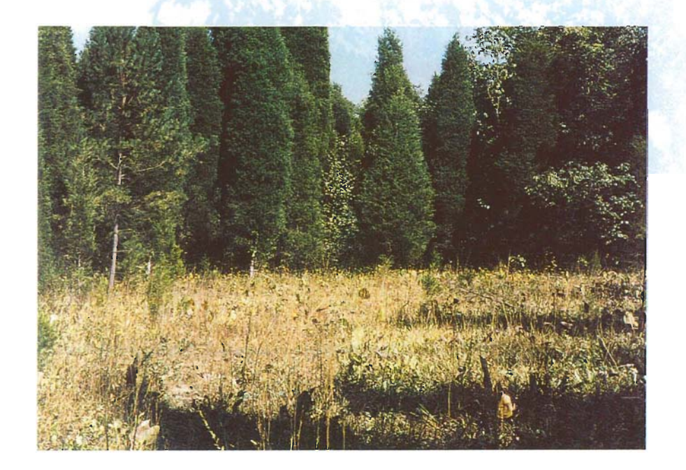
Figure 4. Typical cedar barren on the ORR.

honeysuckle, and butternut) (Table 1) are found in these communities. River bluff communities are generally less susceptible than cedar barrens to ongoing habitat loss because they are too steep and rocky for agricultural use and generally unsuited to intensive urban development other than home construction, trampling, and canopy removal in highly valued lake-front or lakeview property. These sites are not actively mangaed on