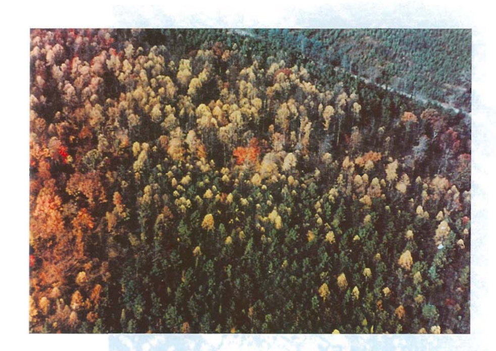
Figure 3. Tulip poplar ( Liriodendron tulipifera ) on an abandoned field adjacent to native forest and young pine plantation.