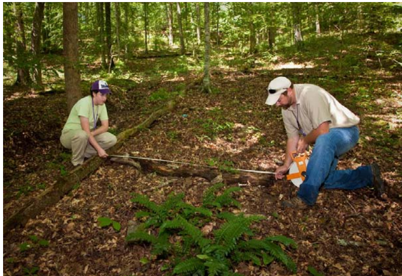
Measurement of log length during CWD sampling

d = diameter of the log (Parminter 1998).