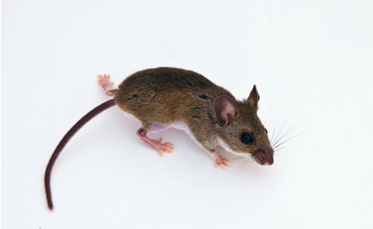
White-footed mouse ( Peromyscus leucopus )