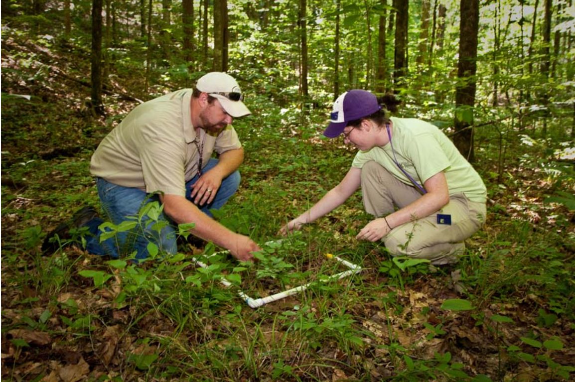
Vegetation sampling in 1/4 m 2 plot

Plant species diversity was measured within a 1/4 m 2 quadrangle and data extrapolated to present results in square meters. Vegetation was sampled along four transect lines at three of the survey sites (Bearden Creek, McNew Hollow, and Gum Hollow). In each quadrangle researchers recorded species, number of stems, and percent cover to determine plant abundance and diversity (Fig. 5).