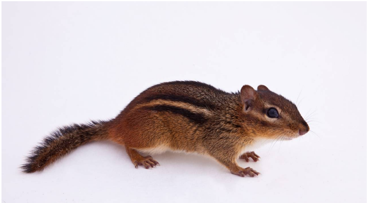
Eastern chipmunk ( Tamias striatus )