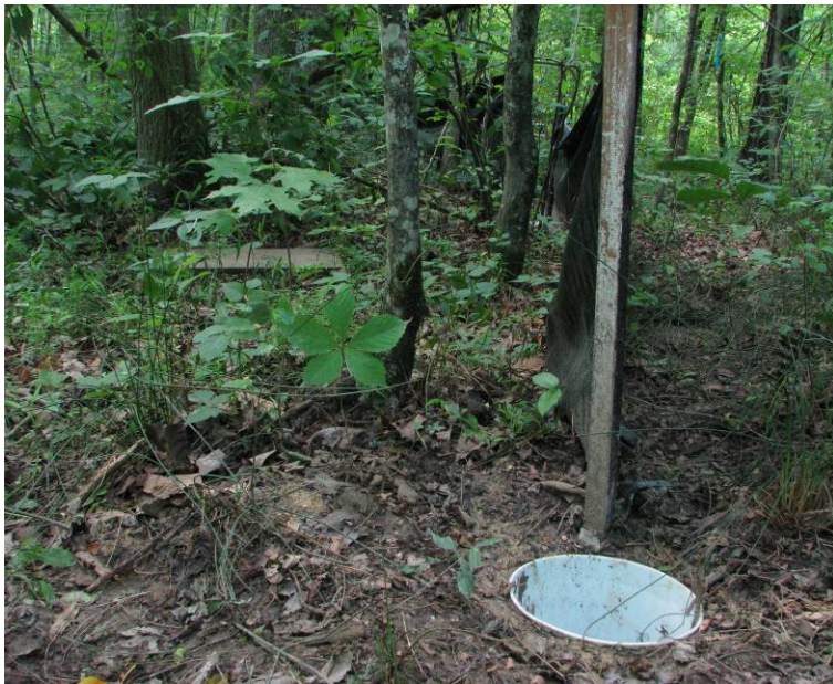
Fig. 3. Pitfall trap with drift fence array.