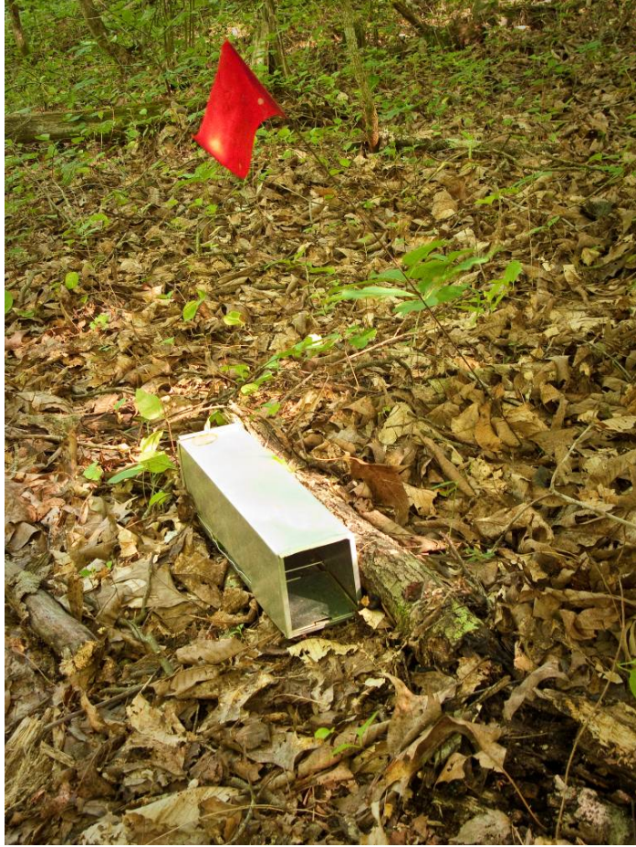
Fig. 2. Sherman live trap setup.