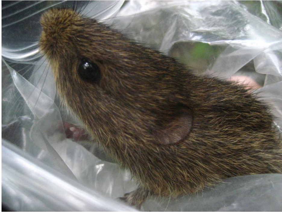
Woodland vole ( Microtus pinetorum )