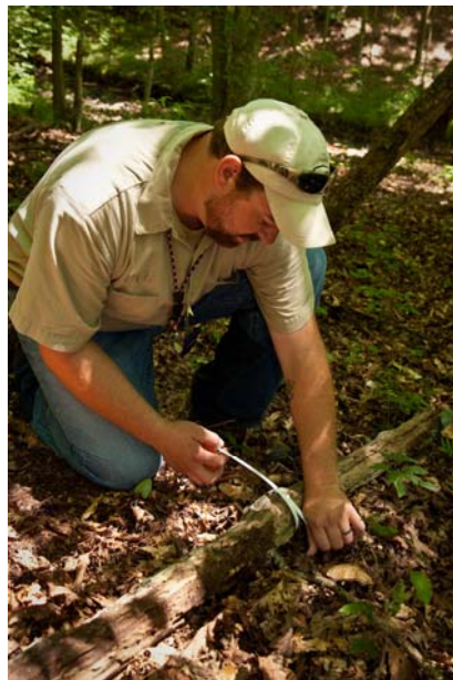
Measurement of log diameter during CWD sampling