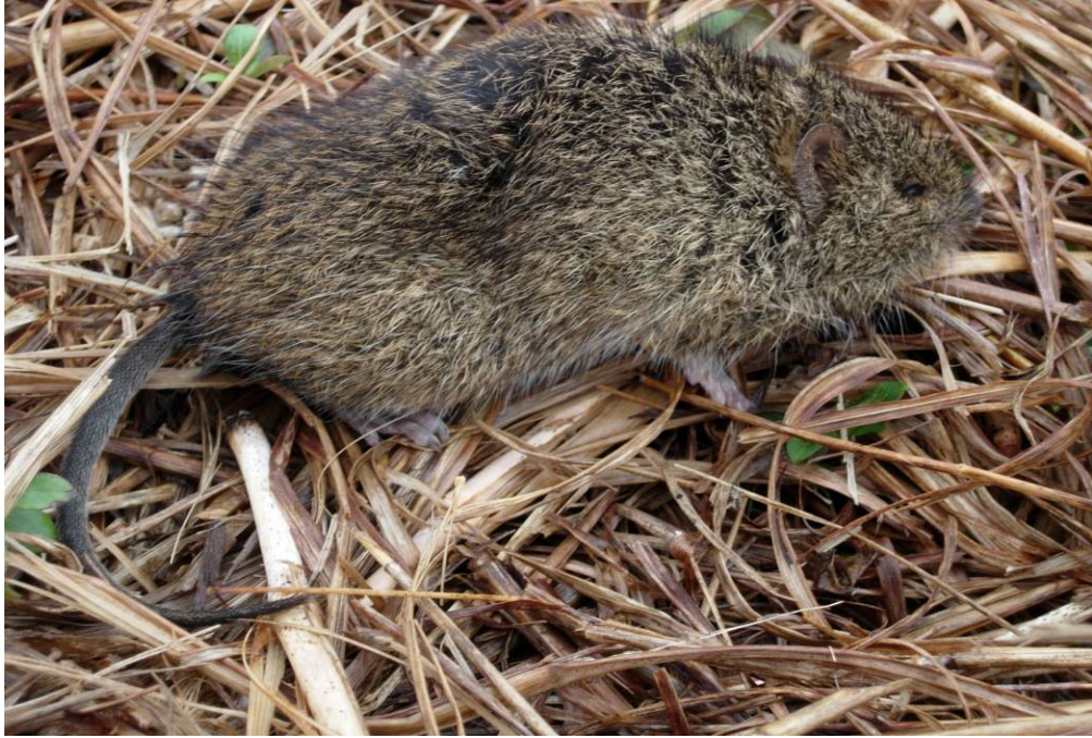
Hispid cotton rat ( Sigmodon hispidus )