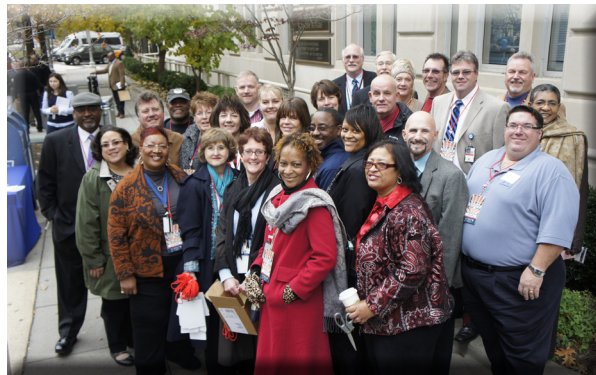
VAVS Staff from VA Central Office and hospitals around the country came together for a special Veteran's Day Celebration and concert in Washington, DC.