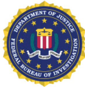
FEDERAL BUREAU OF INVESTIGATION