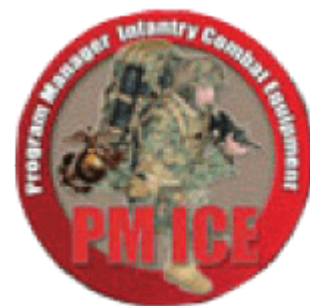
PROGRAM MANAGER- INFANTRY COMBAT EQUIPMENT MARSYSCOM