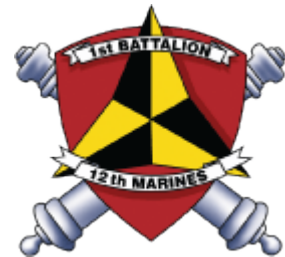
FIRST BATTALION TWELTH MARINES