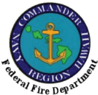
FEDERAL FIRE DEPARTMENT