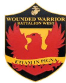
WOUNDED WARRIOR BATTALION WEST