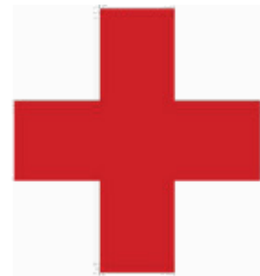
AMERICAN RED CROSS