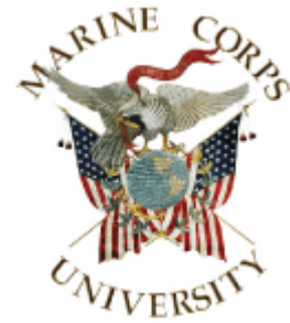
MARINE CORPS UNIVERSITY