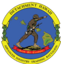
SCHOOL OF INFANTRY DETACHMENT HI