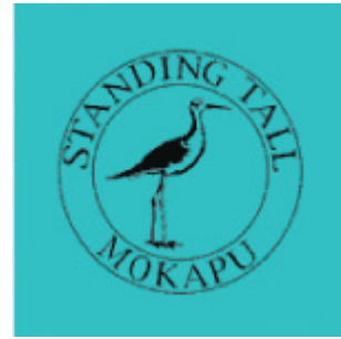
MOKAPU ELEMENTARY SCHOOL