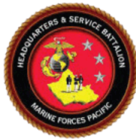
HEADQUARTERS & SERVICE BATTALION MARFORPAC