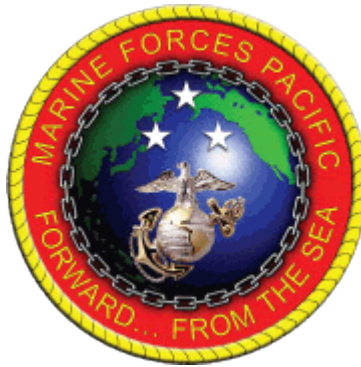
US MARINE FORCES PACIFIC