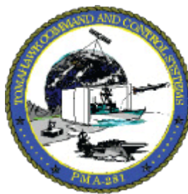
AFLOAT PLANNING SYSTEMS PACIFIC