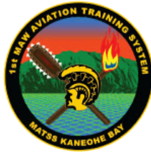
MARINE AVIATION TRAINING SYSTEMS SITE KANEOHE BAY