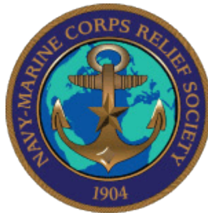
NAVY MARINE CORPS RELIEF SOCIETY