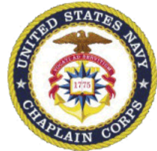
CHAPLAINS RELIGIOUS ENRICHMENT PROGRAM