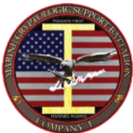
MARINE CRYPTOLOGICAL SUPPORT BATTALION, CO I