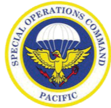
SPECIAL OPERATIONS COMMAND PACIFIC