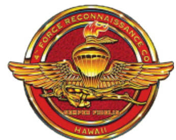
DETACHMENT 4TH FORCE RECONNAISSANCE CO