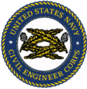
RESIDENT OFFICER IN CHARGE OF CONSTRUCTION