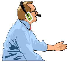
Communicate with Borrowers

Does regular billing exist and is supported by documentation? The regulations require a school to perform and document regular billing. To comply with this requirement, a school must either send a statement prior to the due date of each payment or use a coupon payment system which provides coupons to borrowers no less often than biennially. Past Due notices should not be mistaken for the required billings.