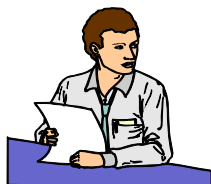
Finding the information

Go to the Source: The answers to these and most questions can be found in the updated Student Financial Aid Guidelines (SFAG). The SFAG including exhibits can be found on its own website at http://www.hrsa.gov/bhpr/dsa/sfag . We invite schools to visit the site.