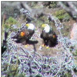
Montrose Settlement Restoration Program, Palos Verdes - see case highlights.