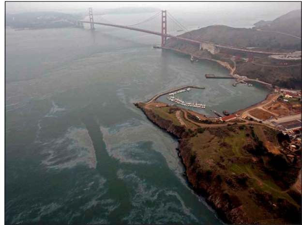
Cosco Busan, San Francisco Bay - see case highlights.