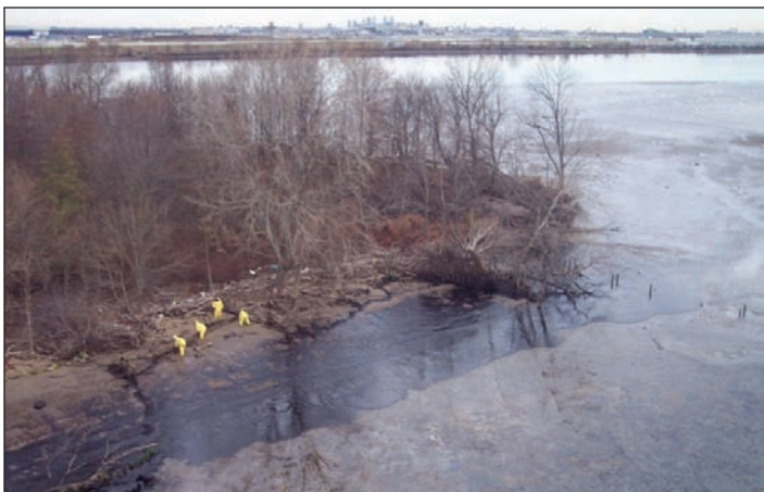
M/T Athos I Oil Spill, DE, PA, NJ - see case highlights.