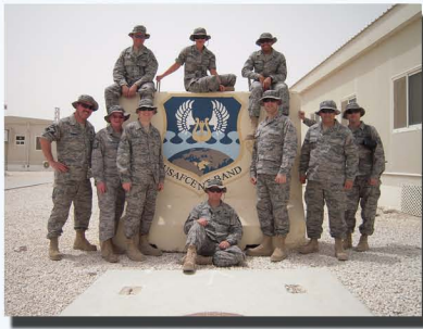
The Band of the Northwest performed 21 concerts in Iraq, Kuwait, Qatar and Afghanistan. Audiences consisted from 50-350 military members. Over 6,000 troops were entertained.