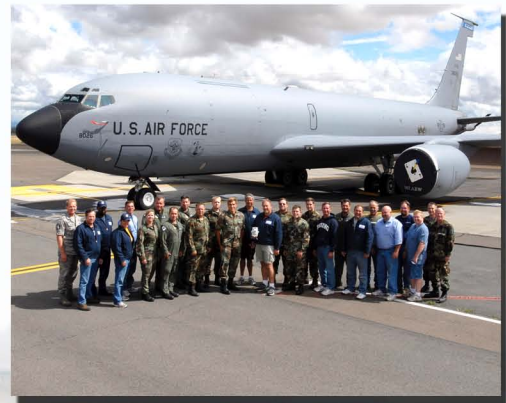
Performed Control Column Actuated Brake modifications on 49 aircraft with 87 percent finishing on time or ahead of schedule.