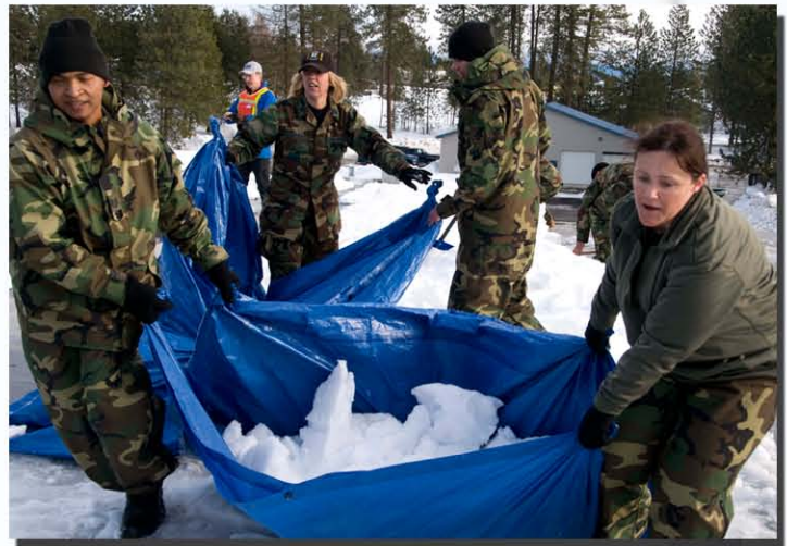
During a Washington State emergency, Air National Guard members cleared more than 80 miles of roadways in less than two weeks.