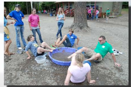
More than 70 volunteers worked with 111 military children during a five day/four night camp to help children cope with the challenges of parent deployment.