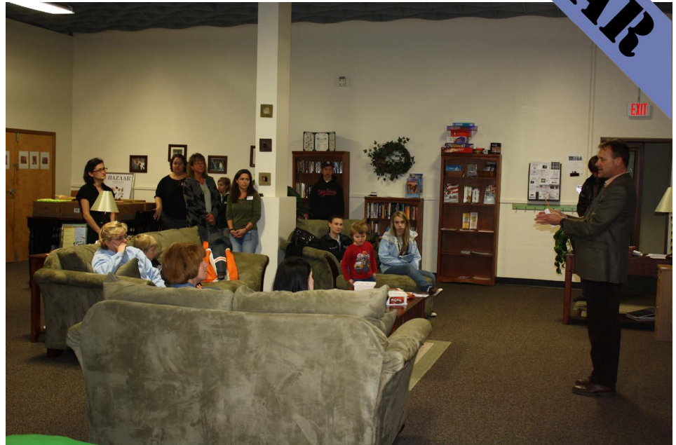
Family members of deployed security forces meet together to receive helpful information from local community organizers.

The highlight of the evening was provided