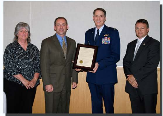
Spokane County Commissioners proclaim the month of August as Air National Guard month.