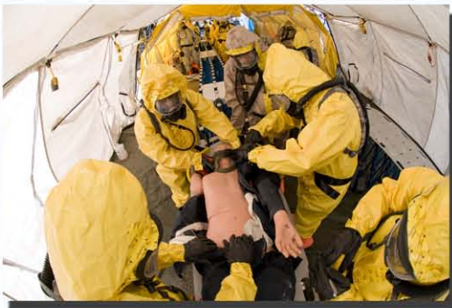
Volunteer CERF members participated in exercises while preparing for support of the 2010 Winter Olympics.