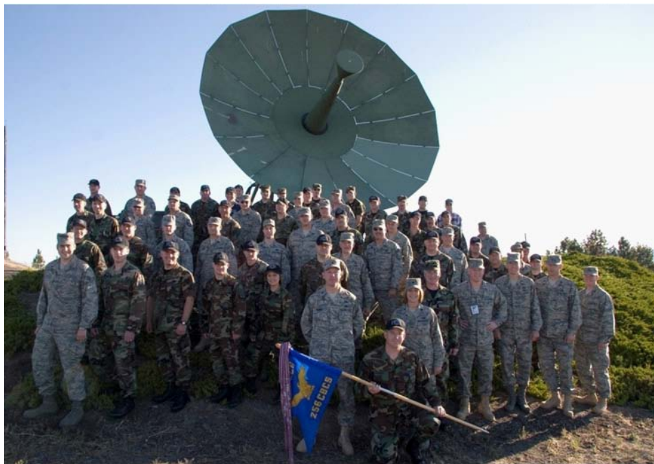
256th CBCS members stand in front of a satellite communications dish at former location near Four Lakes Cheney.

change of command, career field changes and pushed up deadlines for a major move, 256th CBCS personnel have made each day count