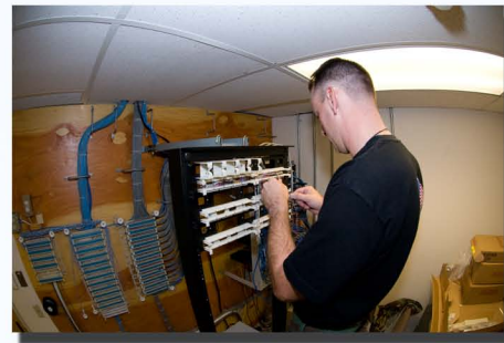
141st members took the lead for the client management process across Fairchild Air Force Base during Total Force Integration moves.