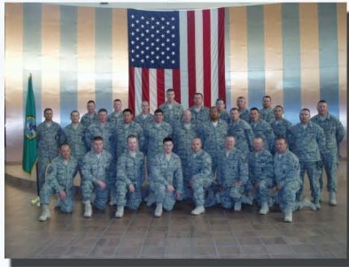
Security Forces spent the holidays in Iraq while deployed for six months.