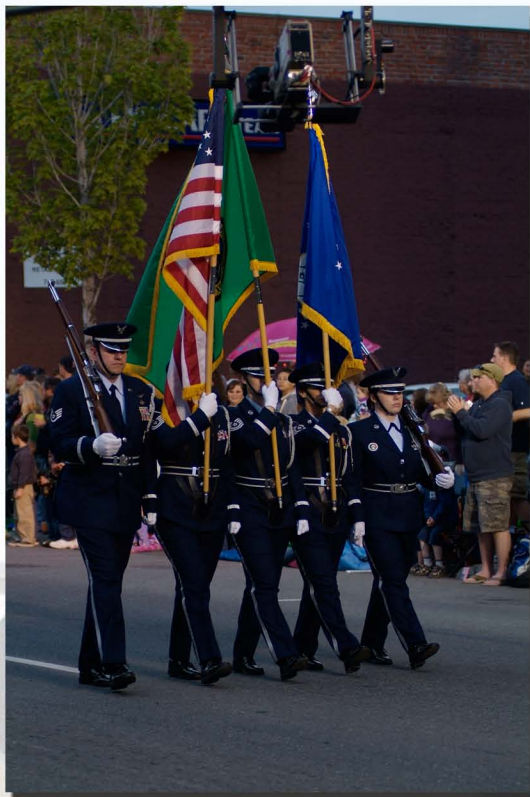
The 141st Honor Guard represented the Wing and National Guard at 59 ceremonies.