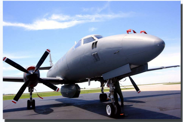
Two RC-26 pilots flew more than 100 combat sorties providing critical reconnaissance for OIF warfighters.