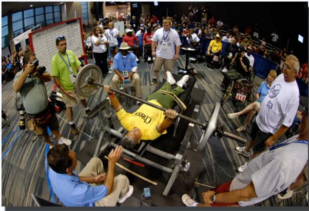
Wing volunteers played a key role during the 29th National Veterans Wheelchair Games held in Spokane in July ensuring the safety of over 500 athletes.