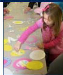
Children of military members make new friends while getting ready for the Easter Egg Hunt.