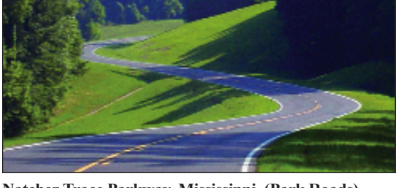
Natchez Trace Parkway, Mississippi (Park Roads)