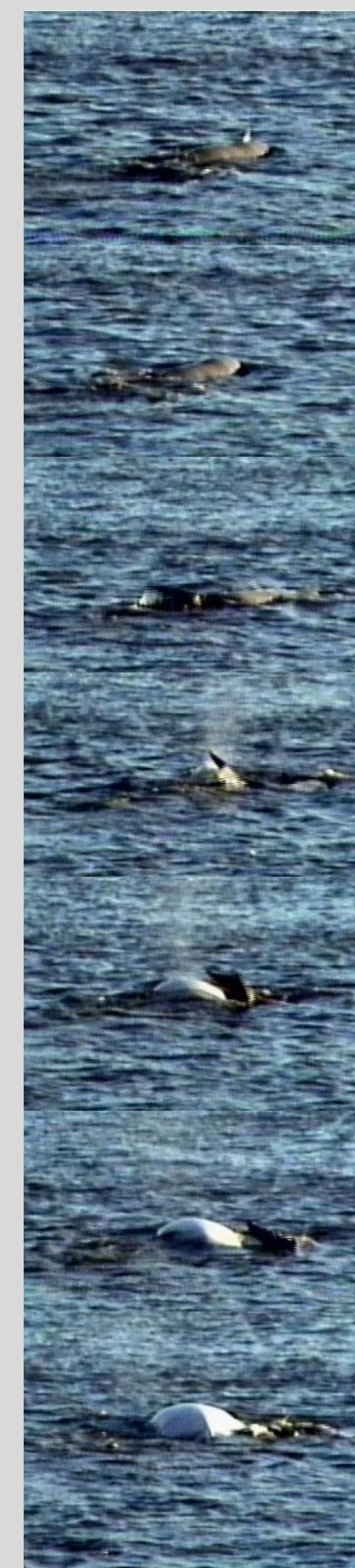
Beluga mother & neonate: Mother seems to be pushing baby to surface.