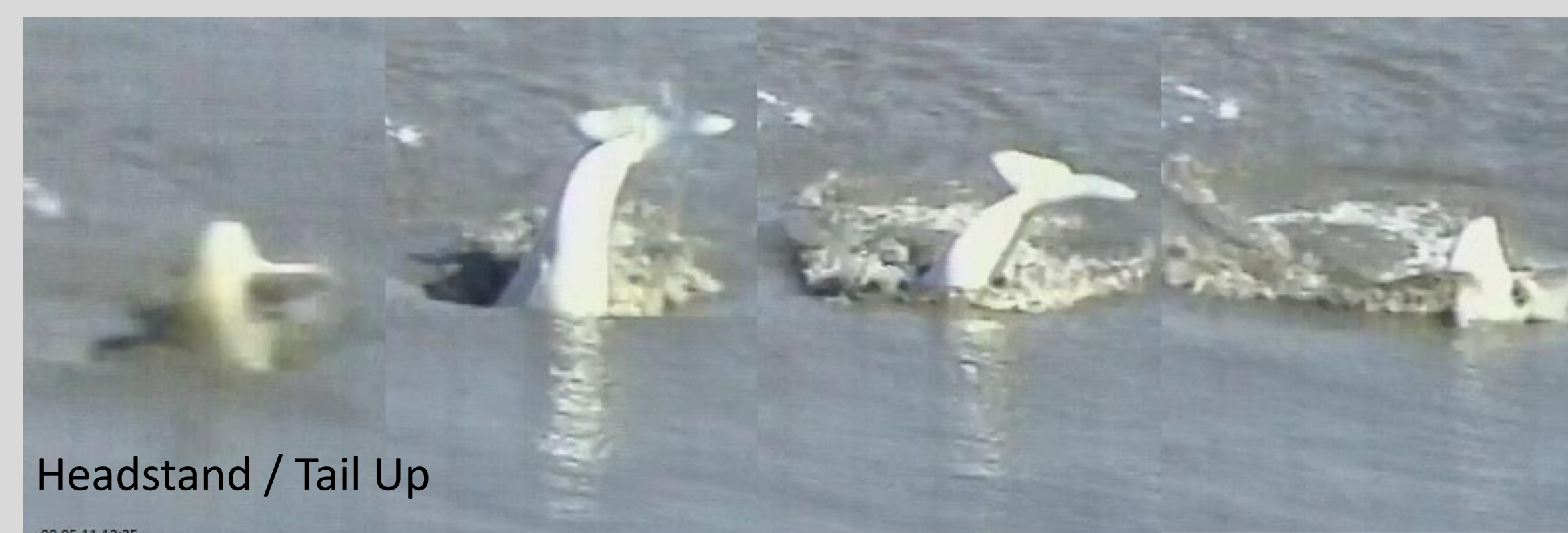
Headstand / Tail Up