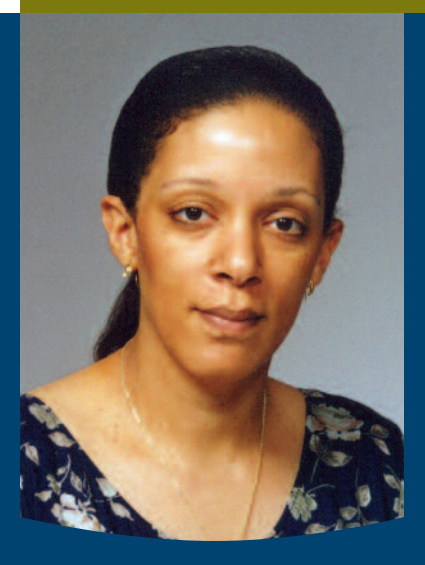
"People, Quality, Service and Stewardship. Simply put, these are the principles that will guide us."