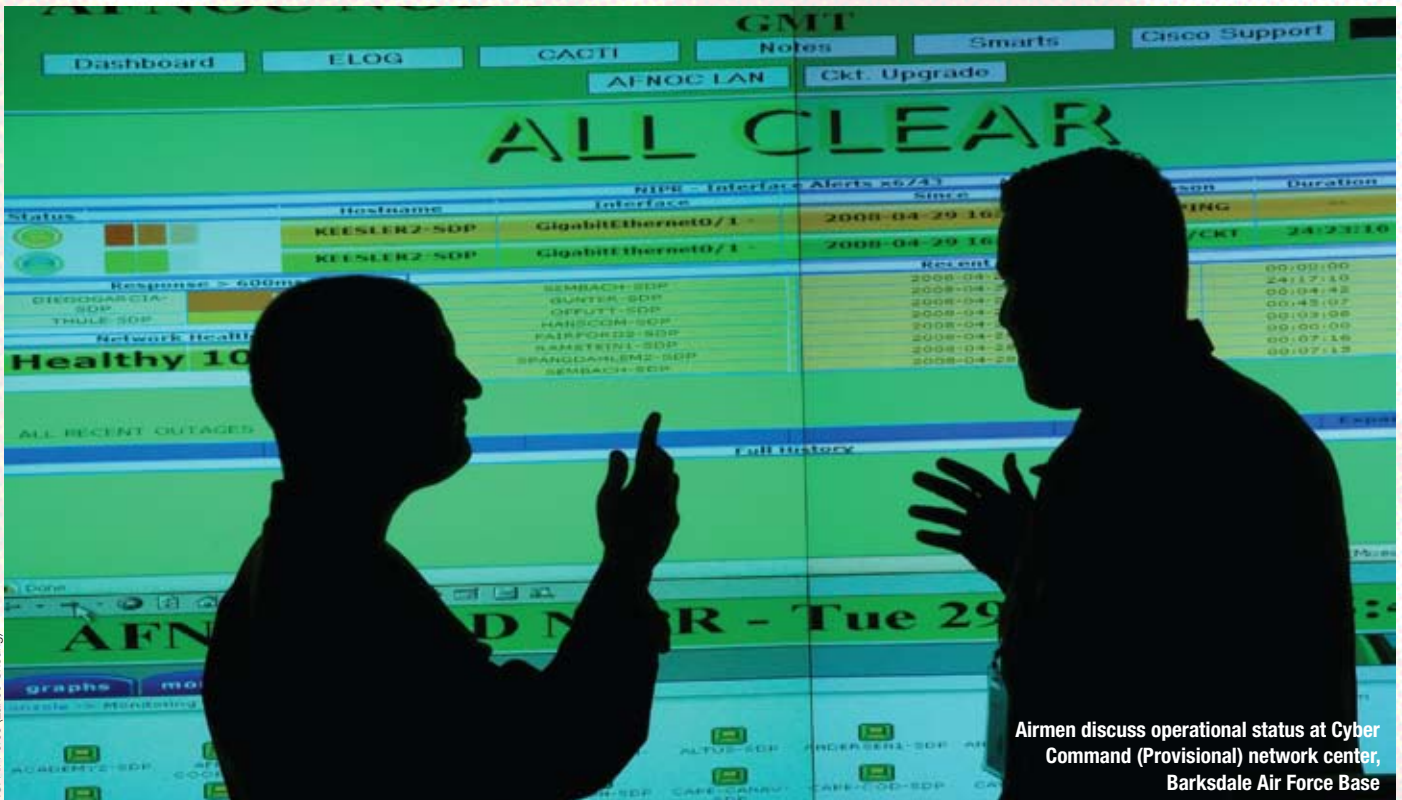
Airmen discuss operational status at Cyber Command (Provisional) network center, Barksdale Air Force Base