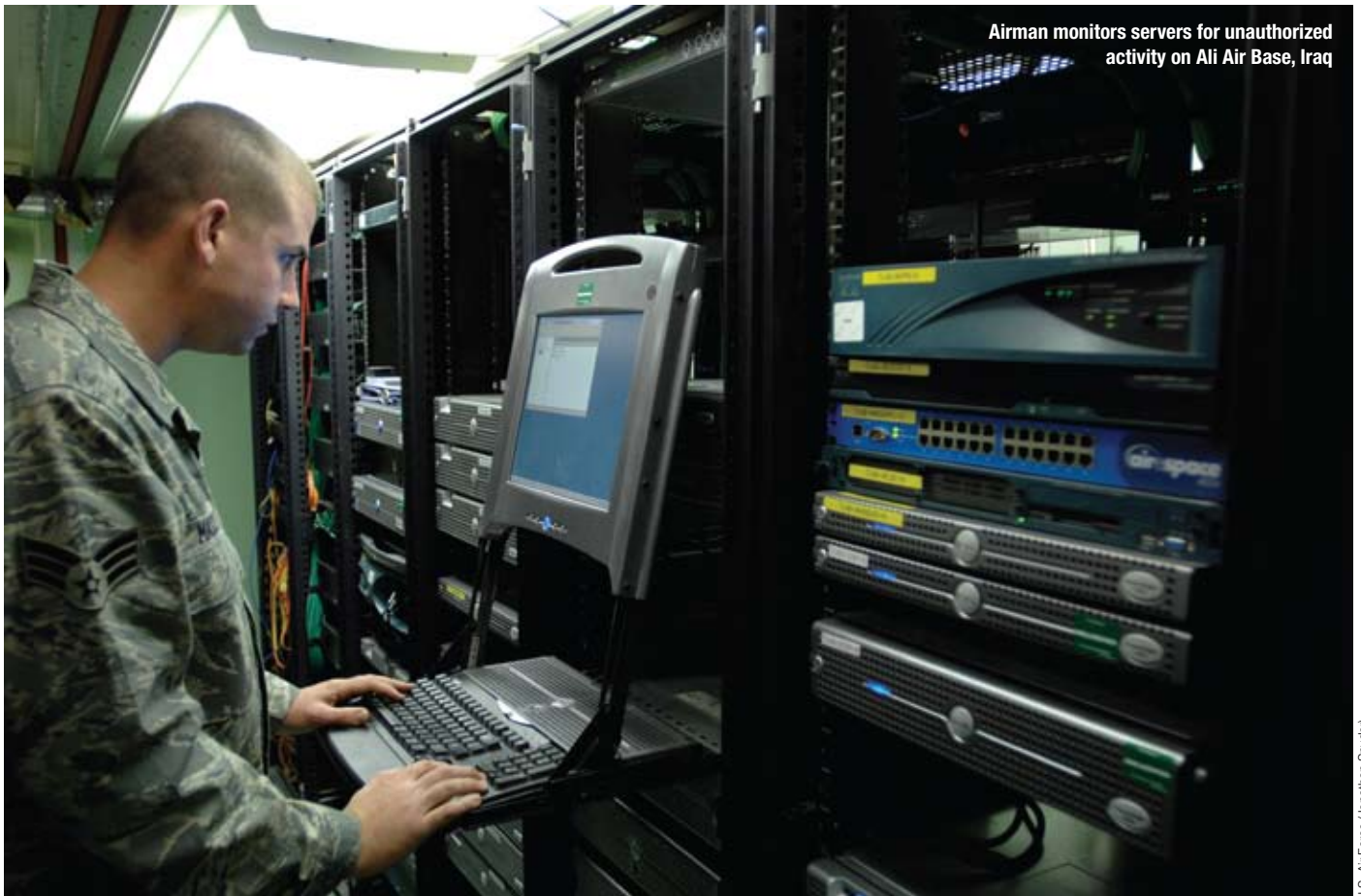
Airman monitors servers for unauthorized activity on Ali Air Base, Iraq

Commoditization. Under old normalcy, individuals developed malware. Under cyber new normalcy, anyone can obtain malware at the “cyber drive-through window.” The Internet is a profit-generating machine for criminal syndicates that have perfected malware-as-a-service. The Organisation for Security and