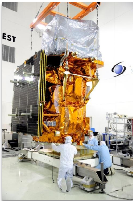
LDCM Observatory positioned on its processing cart in the high bay at ASO. Credit – Daniel Liberotti-USAF 30SW.jpg

With its February 11 launch date approaching, NASA's [and USGS's] Landsat Data Continuity Mission spacecraft, or LDCM, was attached to its payload adapter on January 17 at Vandenberg Air Force Base in California. The adapter serves as the satellite's interface with the United Launch Alliance Atlas V launch vehicle. Encapsulation of the spacecraft into the payload fairing is scheduled for next week on Jan. 23. The payload will then be transported to the pad at Space Launch Complex 3 and hoisted atop the rocket. Source: http://www.nasa.gov/mission_pages/landsat/launch/