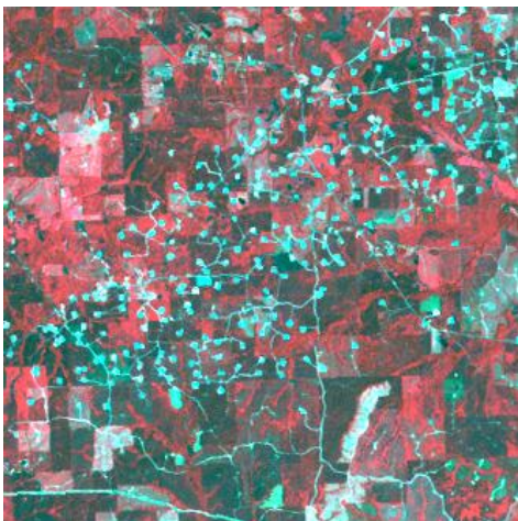
Thematic Mapper (TM) image from August 2, 2010 shows newer natural gas well pads.