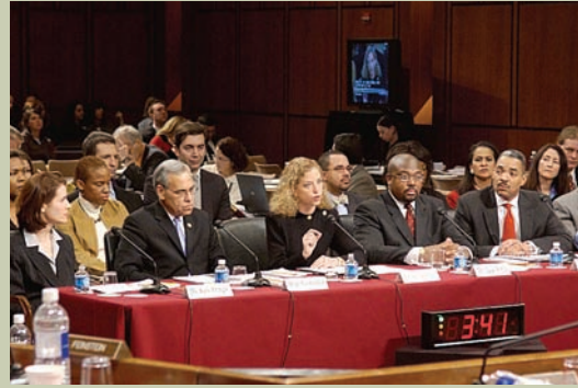
In 2006 Rep. Wasserman Schultz was asked to testify at the Senate Judiciary Committee's confirmation hearings on Supreme Court Justice Alito.

Rep. Debbie Wasserman Schultz has been appointed as a member of the House Committee that helps set America's funding decisions.