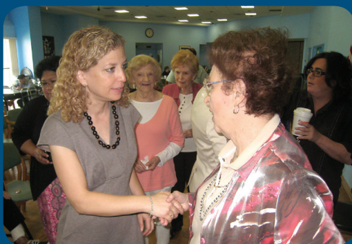
Rep. Wasserman Schultz met with seniors in Sunrise to talk about how to protect themselves from Medicare fraud.

In March I hosted a Medicare safety fair with representatives from state and local organizations to educate seniors on prevention methods and inform them of proactive measures they can take to protect themselves. I'm also a co-sponsor of legislation to remove Social Security numbers from Medicare cards in an effort to help protect the 872,000 South Floridians who have Medicare.