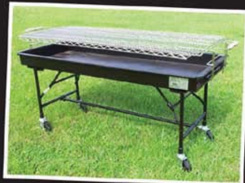
Grill w/Folding Legs

*For more details, please ask one of our Adventure Team Members.