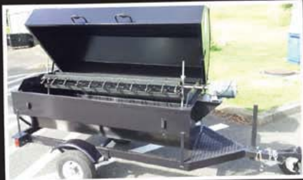
Rotisserie Trailer Grill