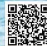
ODR QR Code