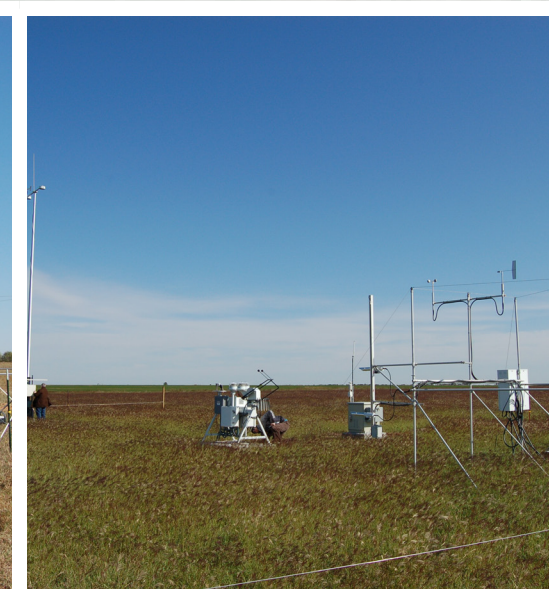
Medford EF-32 (EBBR)