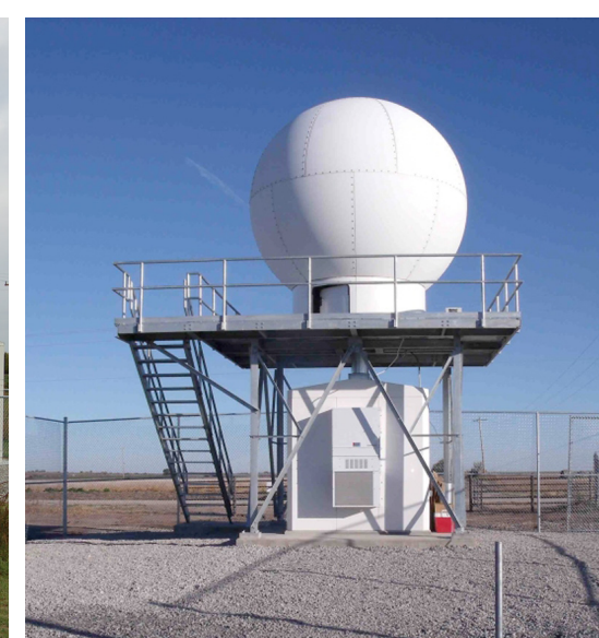
Billings Radar-X (SE)