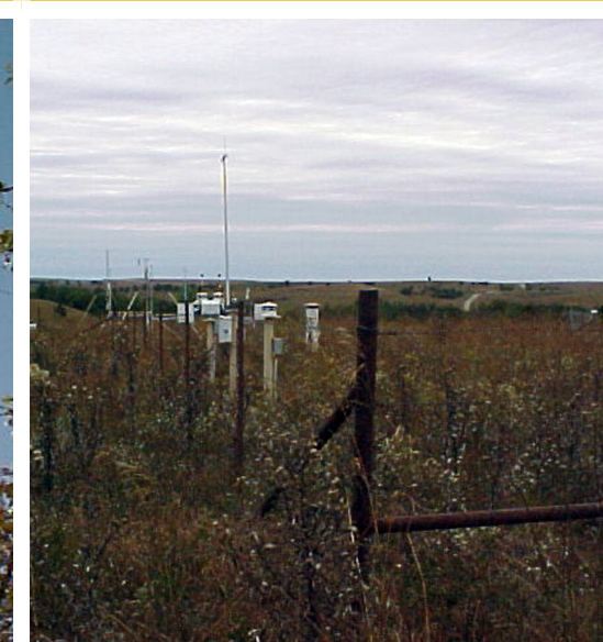
Pawhuska EF-12 (EBBR)