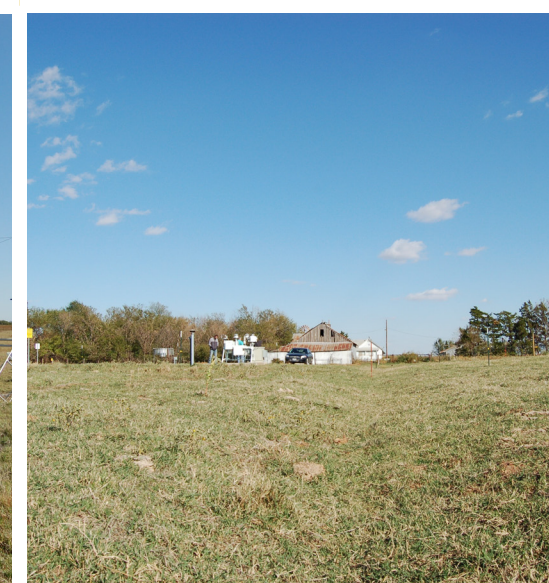
Waukomis EF-37 (ECOR)