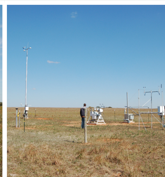
Marshall EF-36 (EBBR)