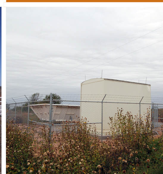
Lamont Profiler-P (NW)