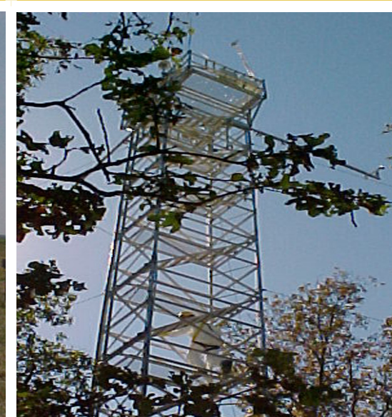
Okmulgee EF-21 (ECOR)