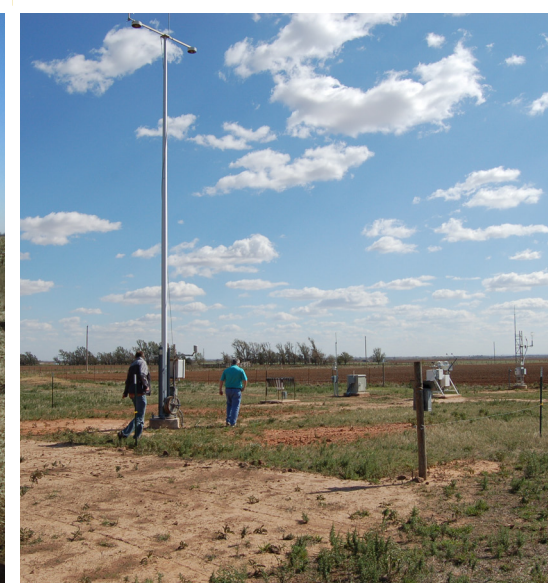
Omega EF-38 (ECOR)