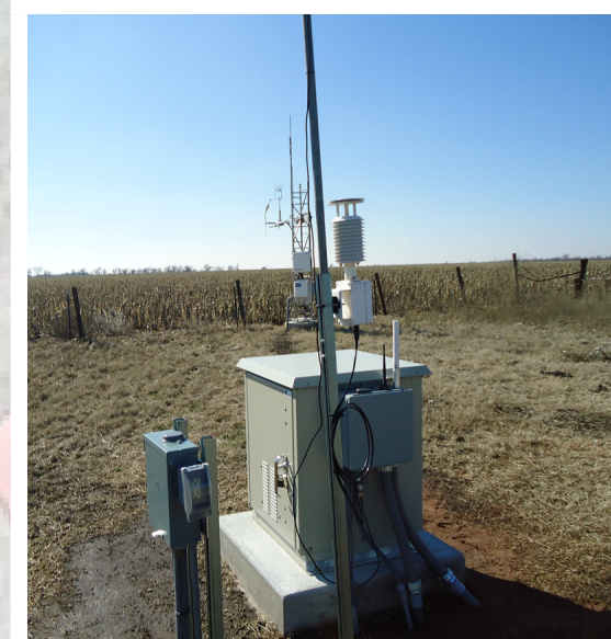
Newkirk EF-33 (ECOR)