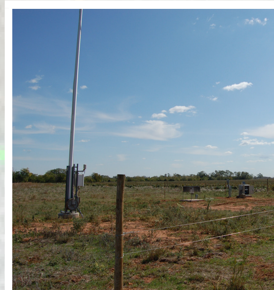
Anthony EF-31 (ECOR)