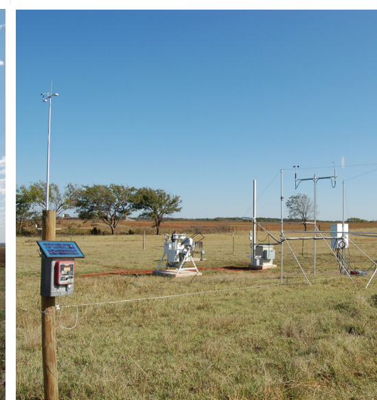
Tryon EF-35 (EBBR)