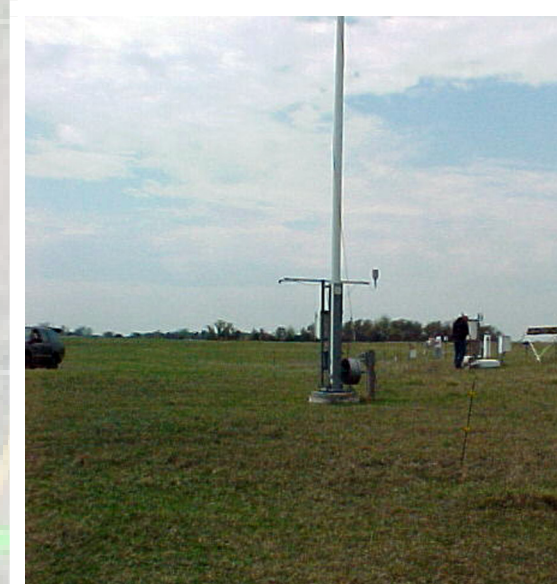
Ringwood EF-15 (EBBR)