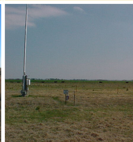
Byron EF-11 (ECOR)