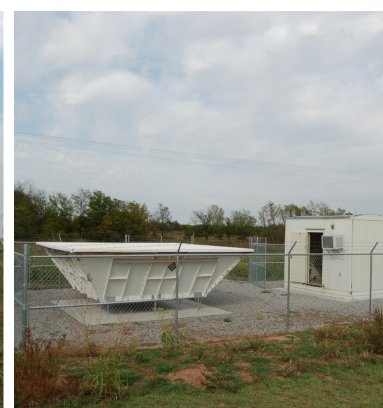
Billings Profiler-P (SE)