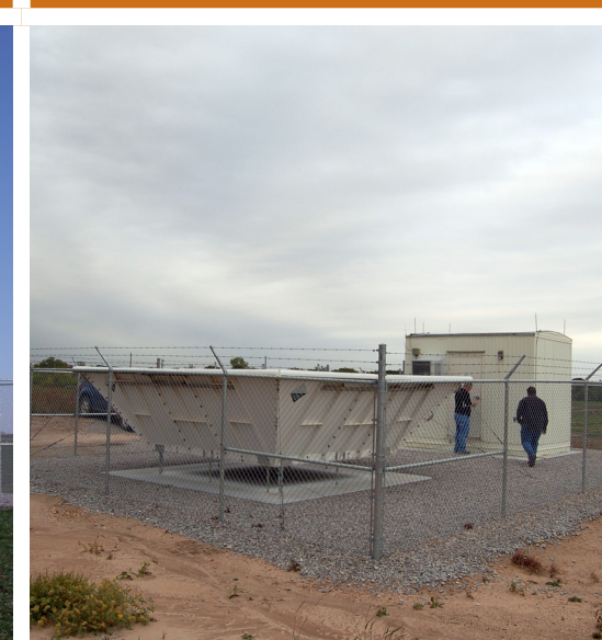
Tonkawa Profiler-P (NE)