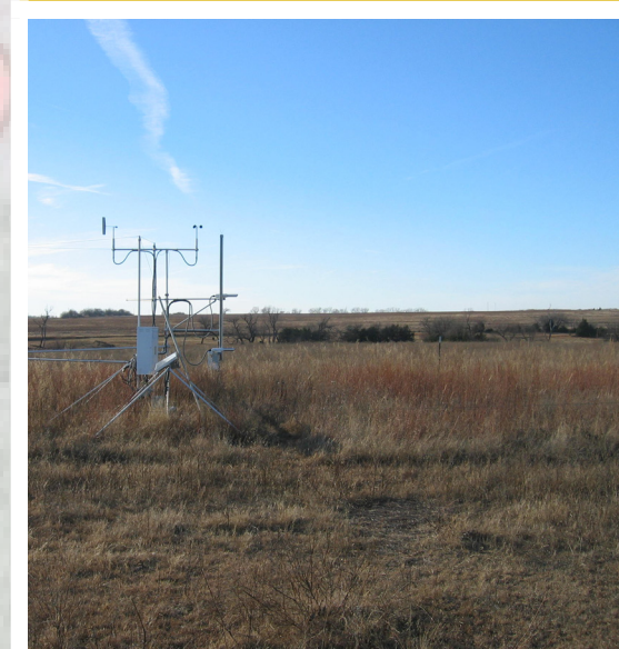
Ashton EF-9 (EBBR)