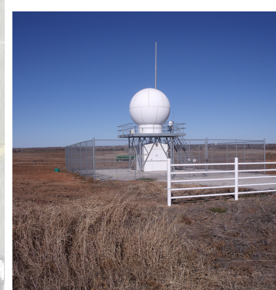
Garber Radar-X (SW)