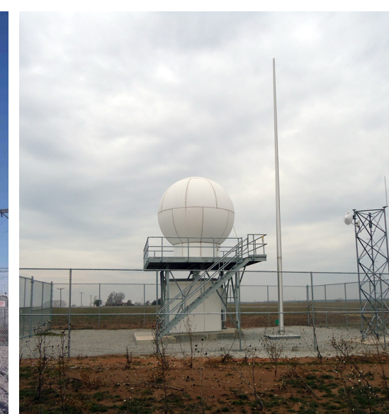
Deer Creek Radar-X (NW)