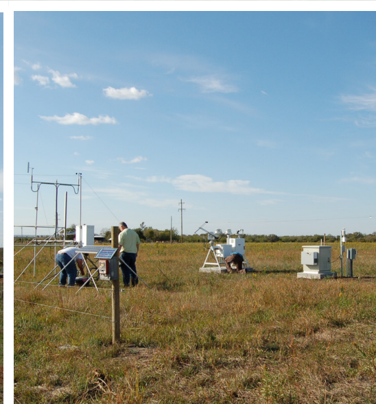
Maple City EF-34 (EBBR)