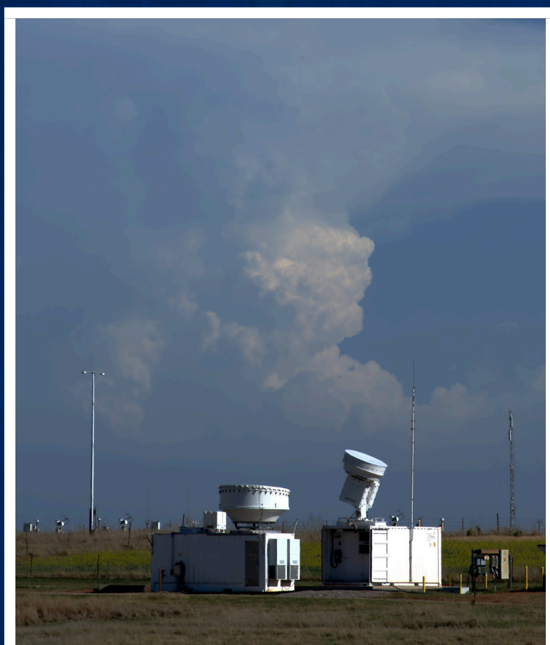
Central Facility Radar-K

During the past two years the SGP has been undergoing a major configuration change that has resulted in new and exciting capabilities. The SGP instrumentation previously contained in 31 measurement sites in a 55,000-square-mile grid has shrunk to 21 sites and to a grid size less than 9000 square miles, for better alignment to current general circulation models, improved operational logistics and efficiencies, and cost savings. This poster illustrates the new SGP footprint and provides pictures of all the new sites.