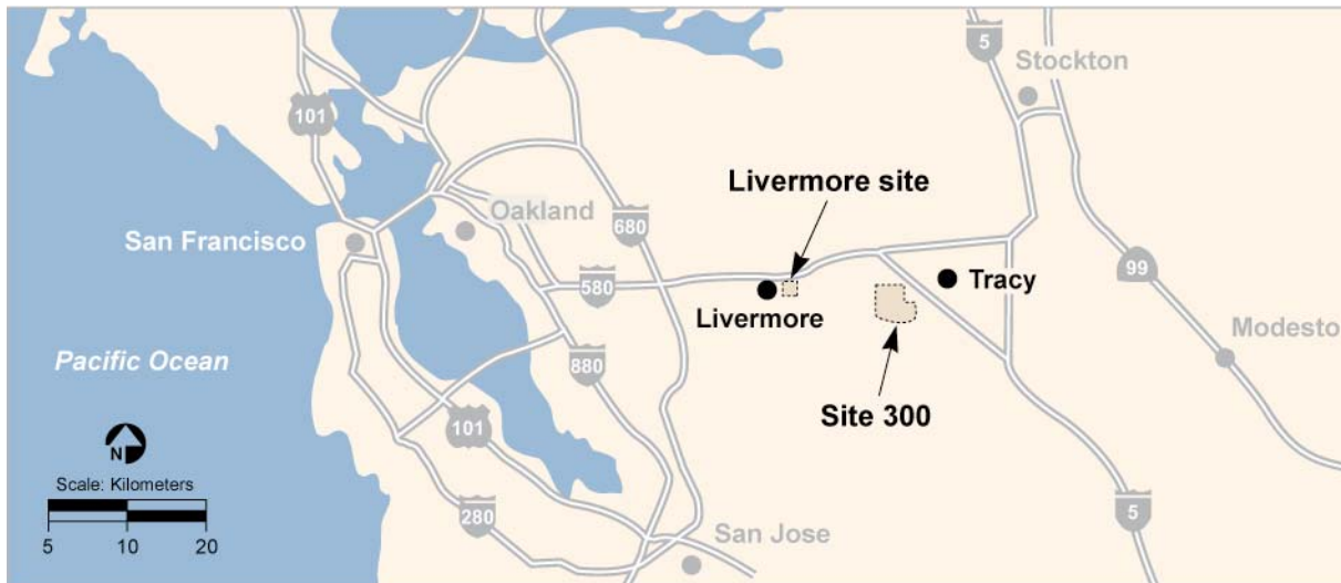
Figure 1-1. Location of the two LLNL sites—the Livermore site and Site 300.

LLNL consists of two sites—an urban site in Livermore, California, referred to as the “Livermore site”; and a rural experimental test site, referred to as “Site 300,” near Tracy, California. See Figure 1-1 .