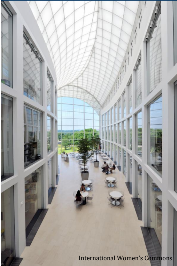
International Women's Commons