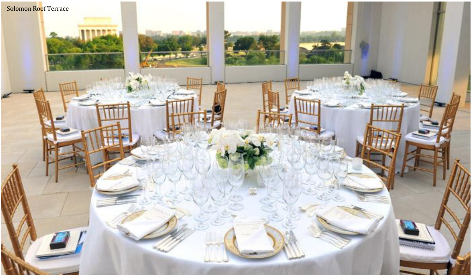
Solomon Roof Terrace