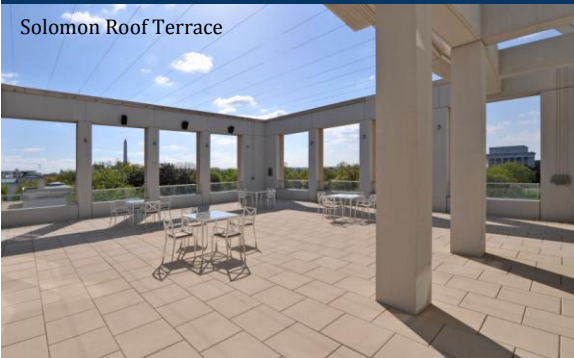
Solomon Roof Terrace