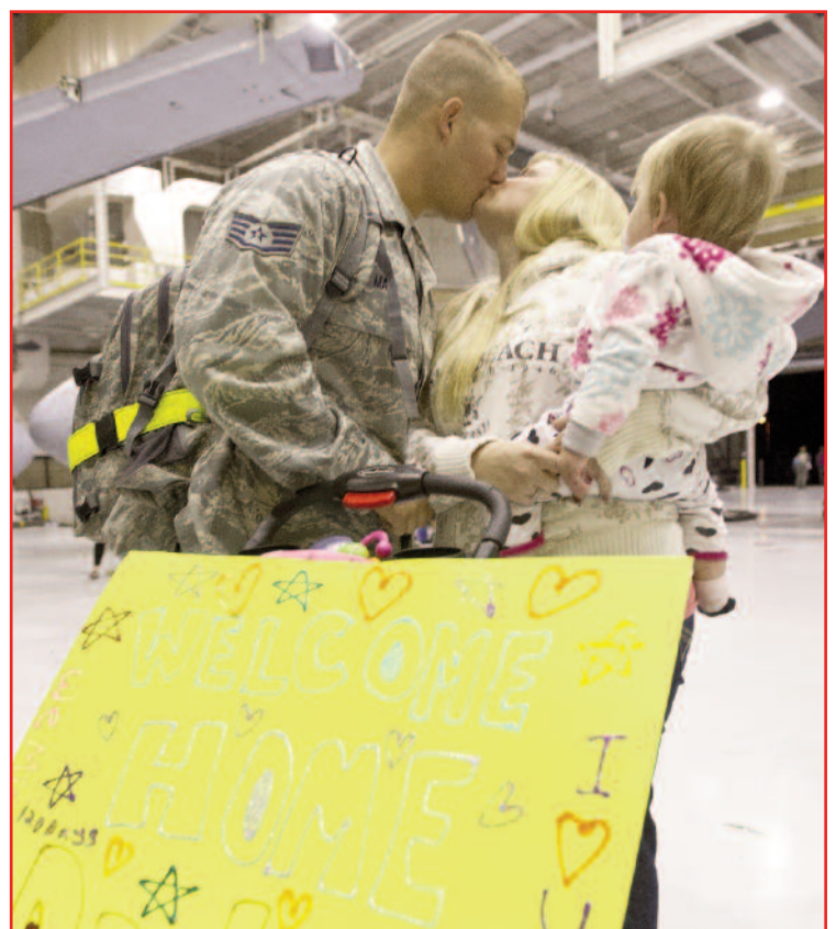
Team JSTARS troops receive a warm welcome home for the holidays in the early morning hours Monday. About 50 JSTARS operations, maintenance and support personnel returned home from a three-month deployment to an undisclosed location.