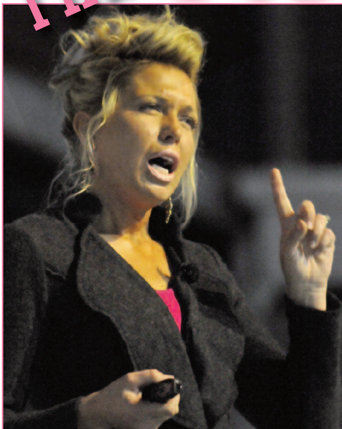
Team Robins gathers for Breast Cancer Awareness Month