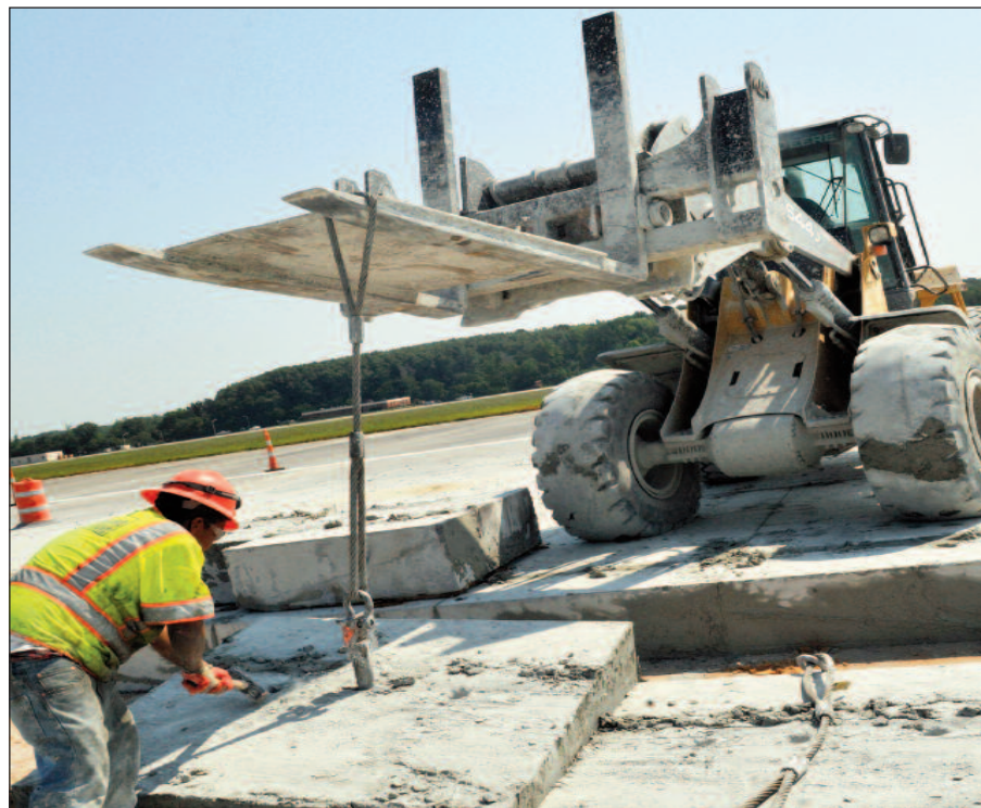
Workers remove concrete slabs from the Runway 33 touchdown zone. Weather permitting, construction is slated for completion next week.

A C-130 on approach for landing flies over the area of the Robins runway undergoing concrete slab replacement. The 12,001-foot-long runway has been reduced to 8,000 feet of operational length during the construction.