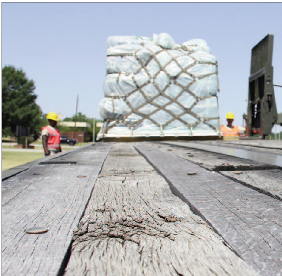
Airmen from the 51st Combat Communications Squadron load pallets on a flatbed truck.