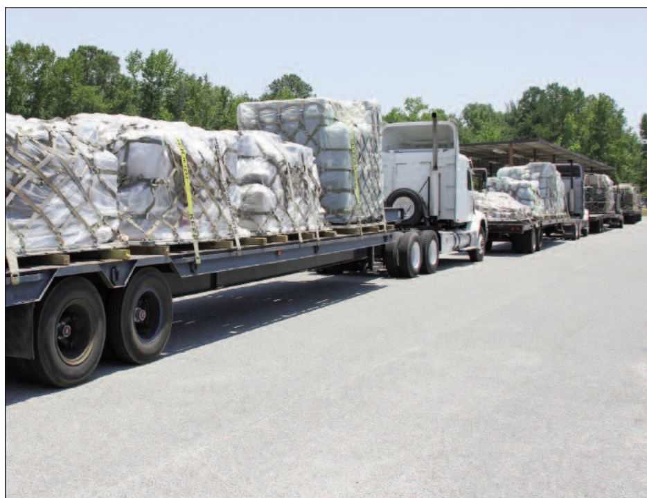
Four flatbed trucks loaded with communications equipment stand ready.