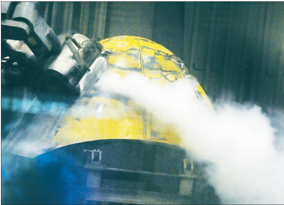
A flashjet removes paint from a C-17 radome. The environment-friendly machine uses a stripping head to burn paint off. Then, a vacuum subsystem removes the burnt paint.