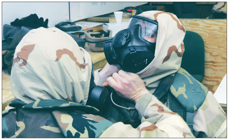
Airmen assist each other in donning protective gear against a simulated chemical attack during a training exercise at Warrior Air Base.