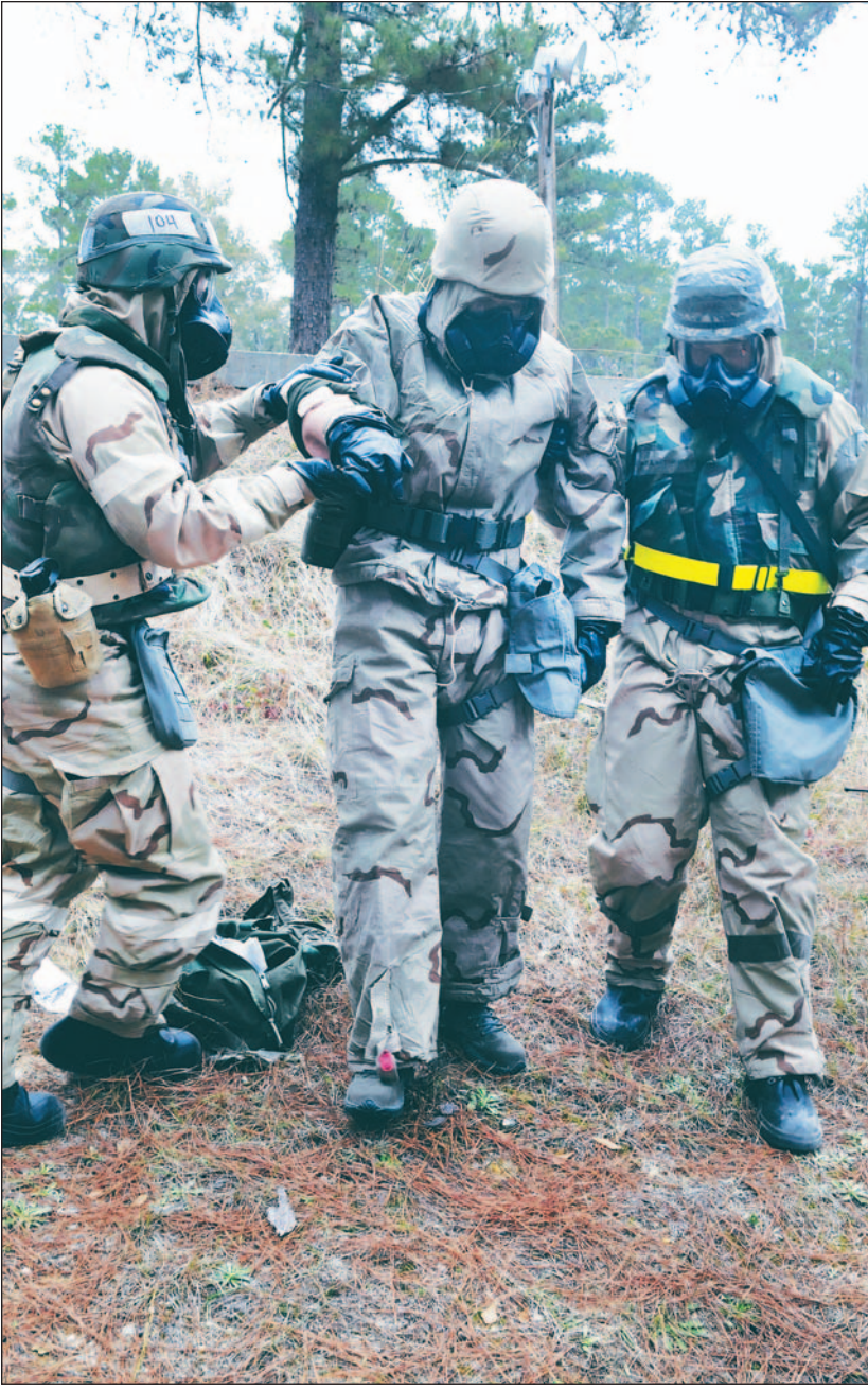
Airmen assist an injured "victim" of a simulated chemical attack during an exercise at Warrior Air Base.

Exercise tests chemical attack readiness skills