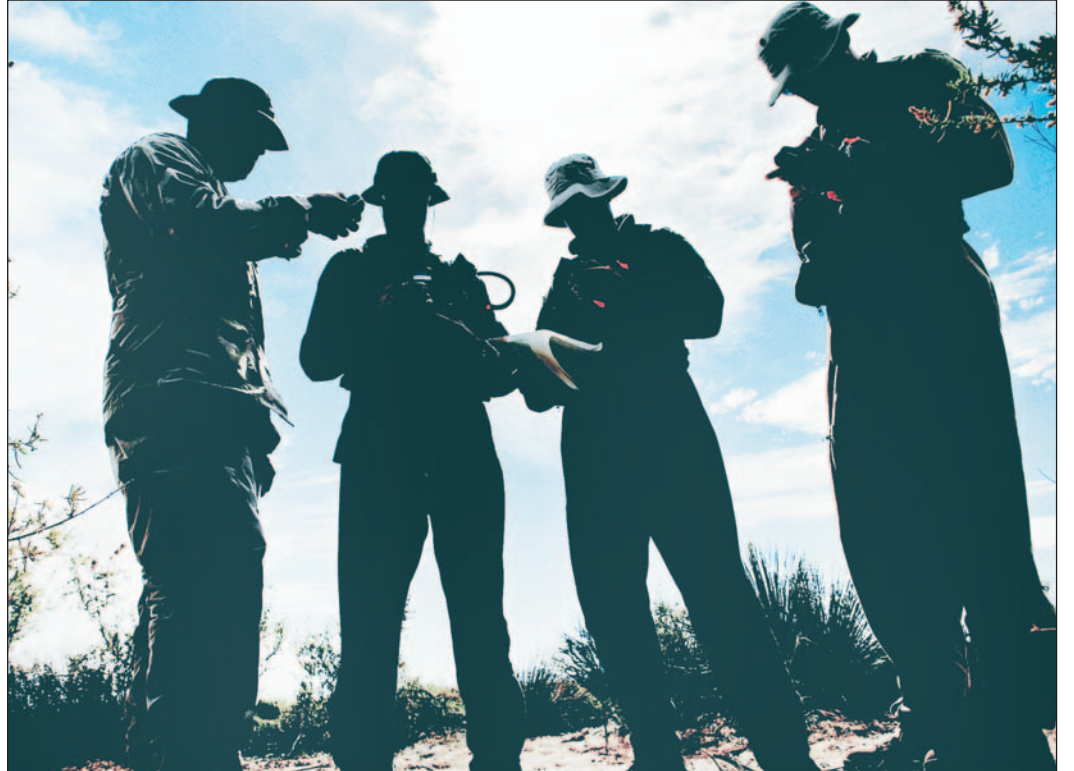
A survival, evasion, resistance and escape specialist demonstrates how to use a Global Positioning System to Airmen with the 7th Fighter Squadron during a SERE refresher training course at Holloman Air Force Base, N.M.