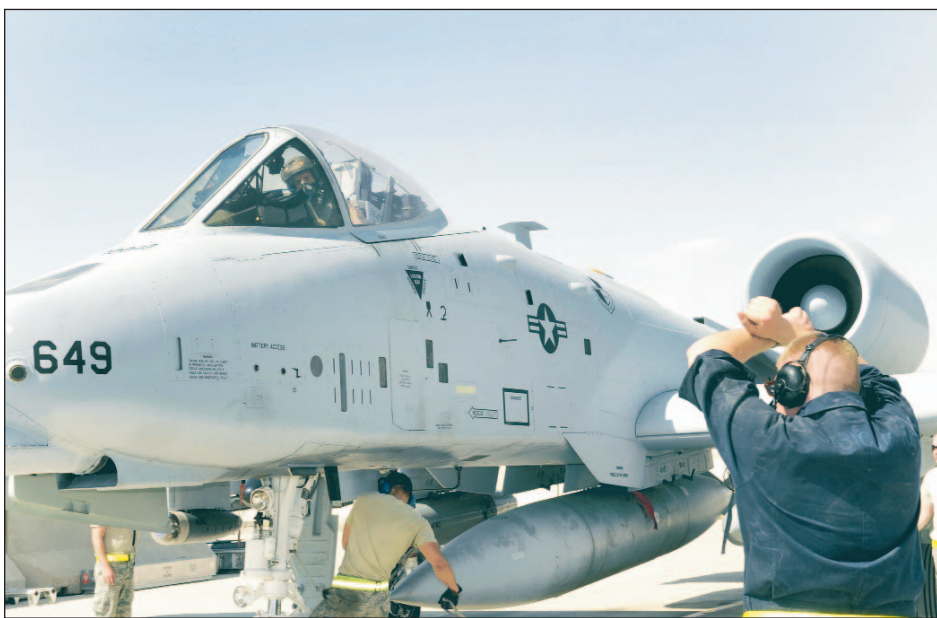
A crew chief gives the signal for an A-10 Thunderbolt II pilot to hold his position at Kandahar Airfield, Afghanistan.