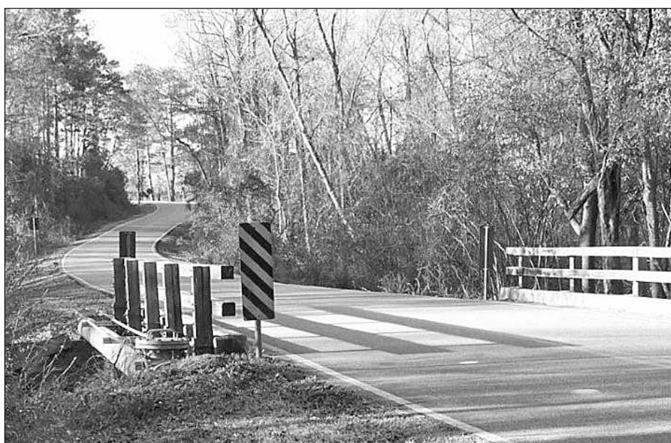
The closure of Hannah Road will allow this bridge to be replaced.

Hannah Road will be closed beginning Sunday.