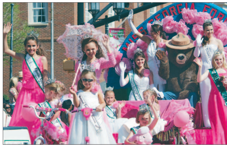
Cherry Blossom queens from various age groups wave to their subjects.