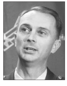
Col. Warren Berry 78th Air Base Wing Commander

The Robins Rev-Up is published by The Telegraph, a private firm in no way connected with the U.S. Air Force, under exclusive written contract with Robins Air Force Base, Ga., of the Air Force Materiel Command. This commercial enterprise Air Force newspaper is an authorized publication for members of the U.S. military services. Contents of the Robins Rev-Up are not necessarily the official views of or endorsed by, the U.S. government, Department of Defense, or Department of the Air Force. The appearance of advertising in this publication, including inserts or supplements, does not constitute endorsement by the Department of Defense, Department of the Air Force, or The Telegraph, of the products or services advertised. Everything advertised in this publication shall be made available for purchase, use, or patronage without regard to race, color, religion, sex, national origin, age, marital status, physical or mental handicap, political affiliation, or any other non-merit factor of the purchaser, user or patron.