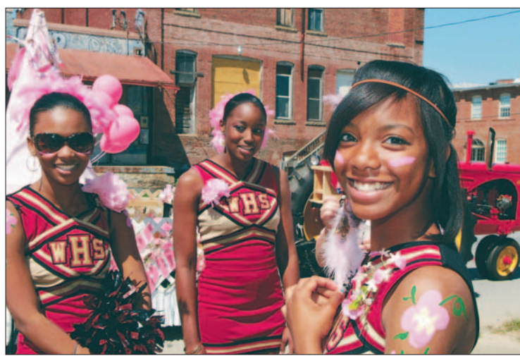
Westside High School cheerleaders wear their parade faces.