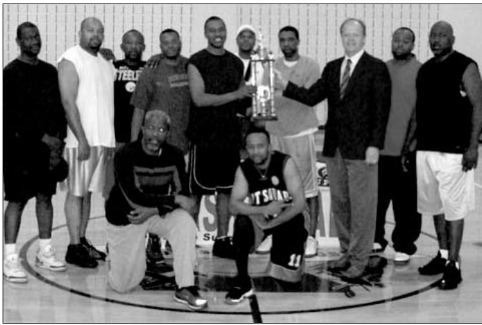
Members of the 542nd Combat Communications Squadron pose with the championship trophy, awarded for winning the Over 30 intramural basketball title. The team grabbed the No. 1 seed with the best regular season record (6-2), and went on to beat the 116th Air Control Wing, 54-47, in the championship game.