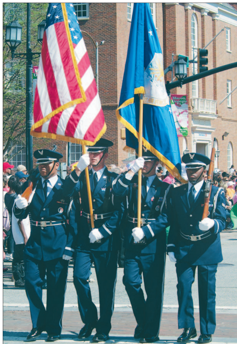
Robins Honor Guard members carry the colors during the parade.