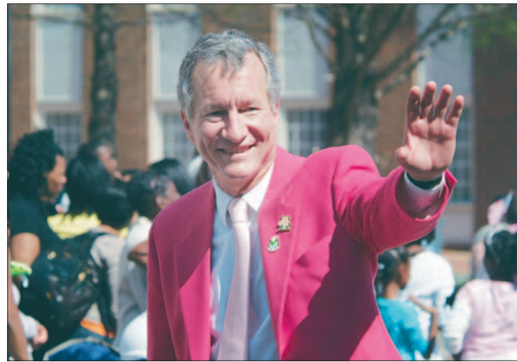
U.S. Representative Jim Marshall, greets parade goers along the route.