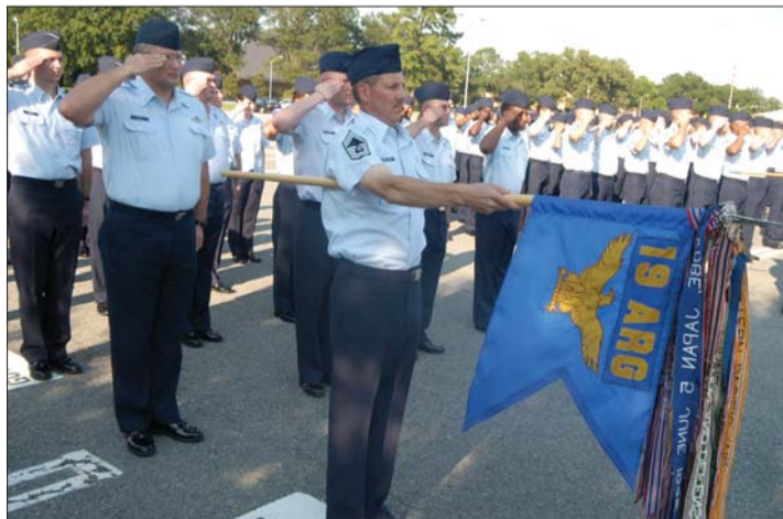
Above left, Members of the 19th Air Refueling Group present arms during the retreat ceremony. The group, which will deactivate during the summer of 2008, was given special recognition for their role in Air Force history over the past eight decades.