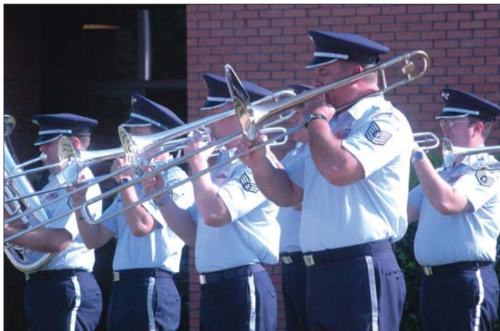
Above right, Members of the Band of the U.S. Air Force Reserve play in honor of the Air Force's 60th Birthday during the retreat ceremony Monday.