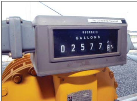
By JAMAL HAYES 116th Air Control Wing

116th Fuel Shop keeps Joint STARS flying