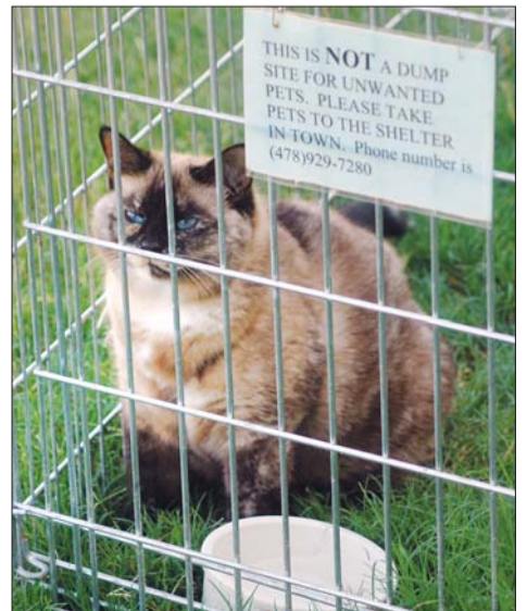
Below, The clinic keeps an outdoor kennel for Cuddlebug, the unofficial mascot of the clinic. The kennel is not a drop site for sick or unwanted animals.