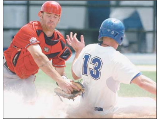
Below: Despite being 6-foot-2, 215 pounds, Bolt is an agile base runner.