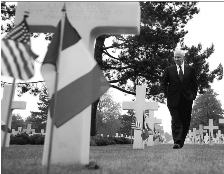
Secretary of Defense Robert M. Gates tours the American Cemetery in Normandy, France, during the 63rd Anniversary of D-Day June 6. The defense secretary was among hundreds of people who walked above the windswept cliffs and paused among fog-shrouded headstones to honor those who died during the D-Day invasion 63 years ago.