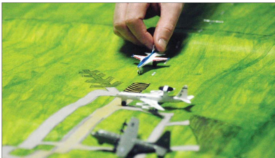
Before the simulator arrived, air traffic control journeymen and apprentices trained using a static board with toy airplanes to run scenarios.

However, the trainers also put a little mischief into the scenarios in the name of fun. One of the traffic calls that is a simulator exclusive is, "You disobeyed orders, now you must suffer the consequences." This call is followed by the immediate combustion of the simulated aircraft. Even