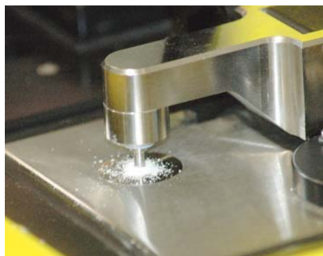
Below, the hammer of a HazMat ID machine compresses a sample on top of a diamond sensor to identify the sample.