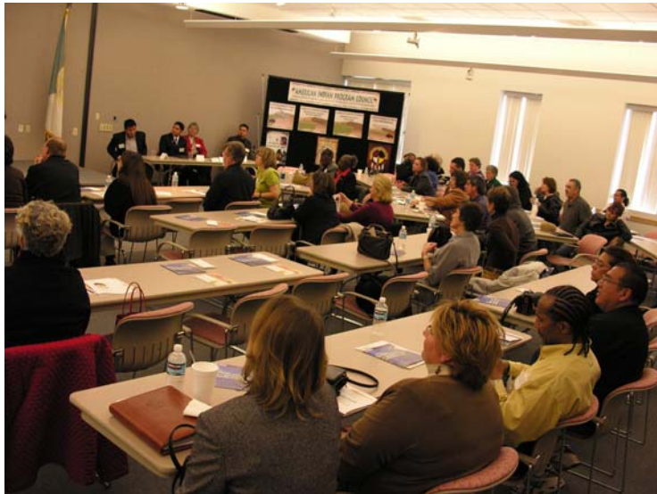
Staying until the very end!!