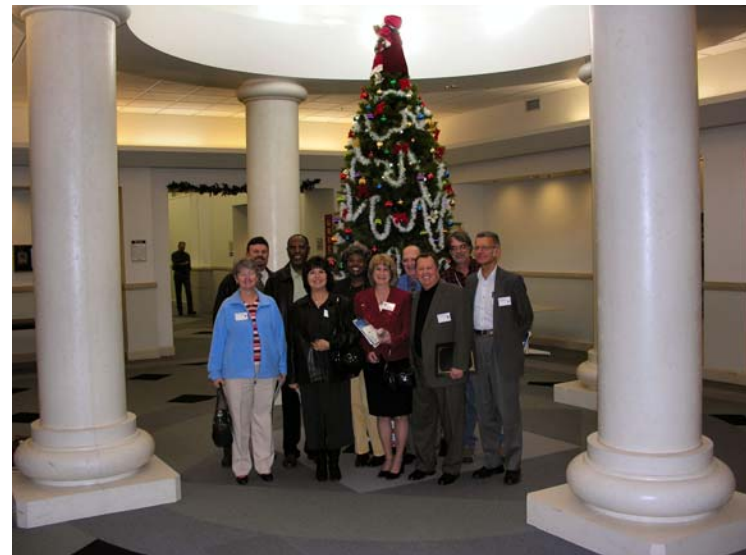
VA employees – happy they came to the seminar!