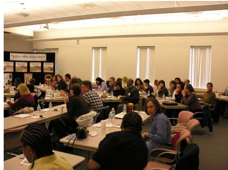
Audience networking & enjoying food.