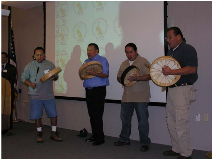
Flag & Honor Song