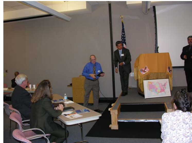
One of our prize winners!