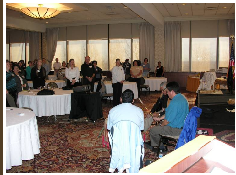
American Indian Flag and Veteran's Song