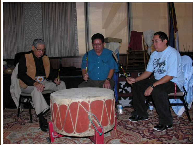
Northern & Southern Plains Indian Singers