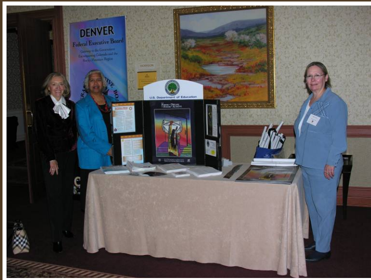
Dept. of Education information booth.