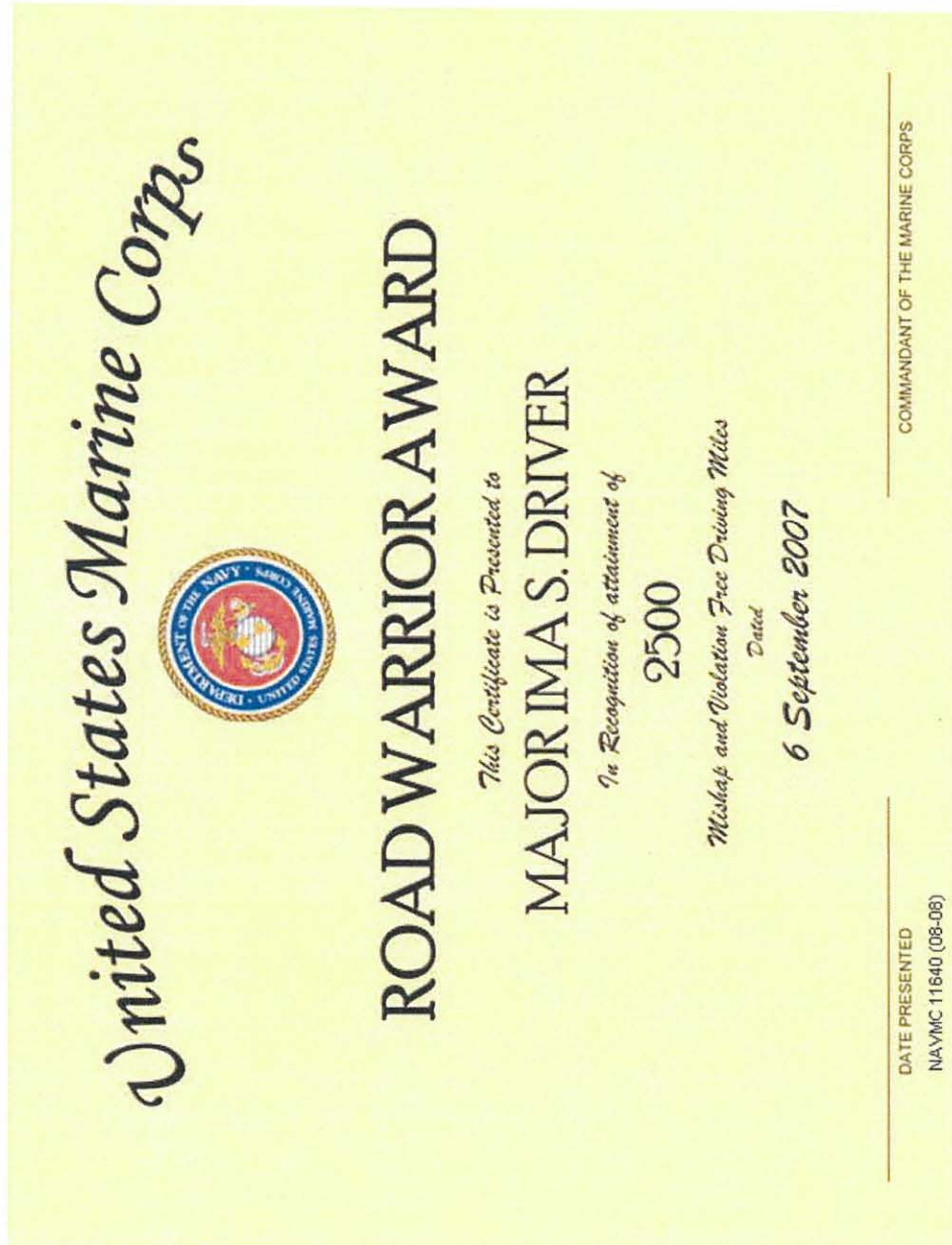
Figure 1-1.--Example Individual Road Warrior Award