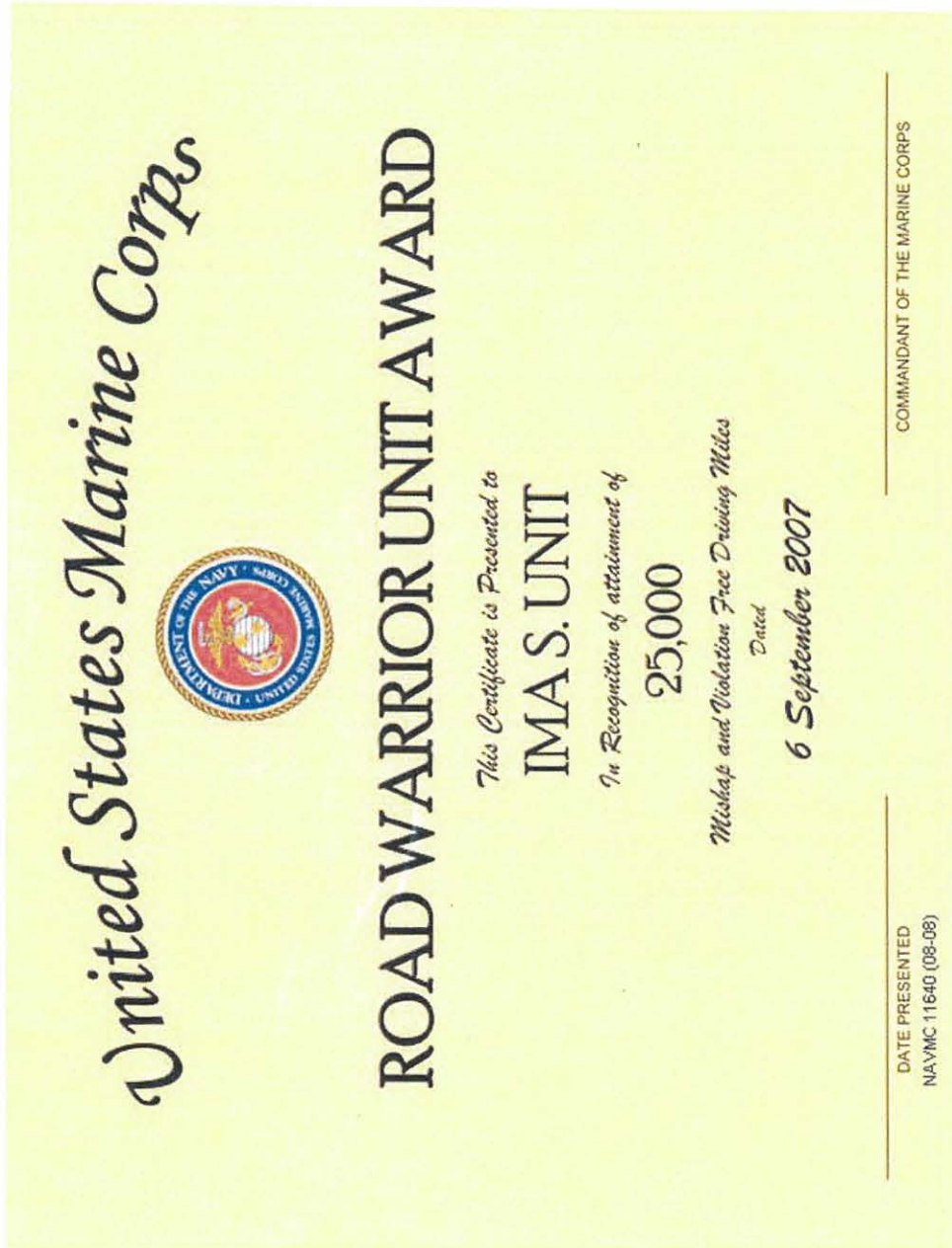
Figure 1-3.--Example Unit Road Warrior Award