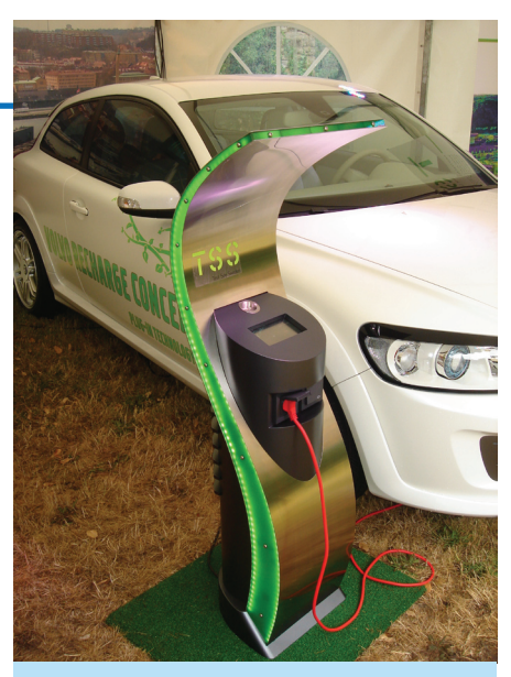
The Test Site Sweden interactive charger concept and the Volvo ReCharge PHEV concept vehicle.

The off-board charging stations will inform the user, provide an opportunity for user input to the recharge process, and manage the billing automatically.