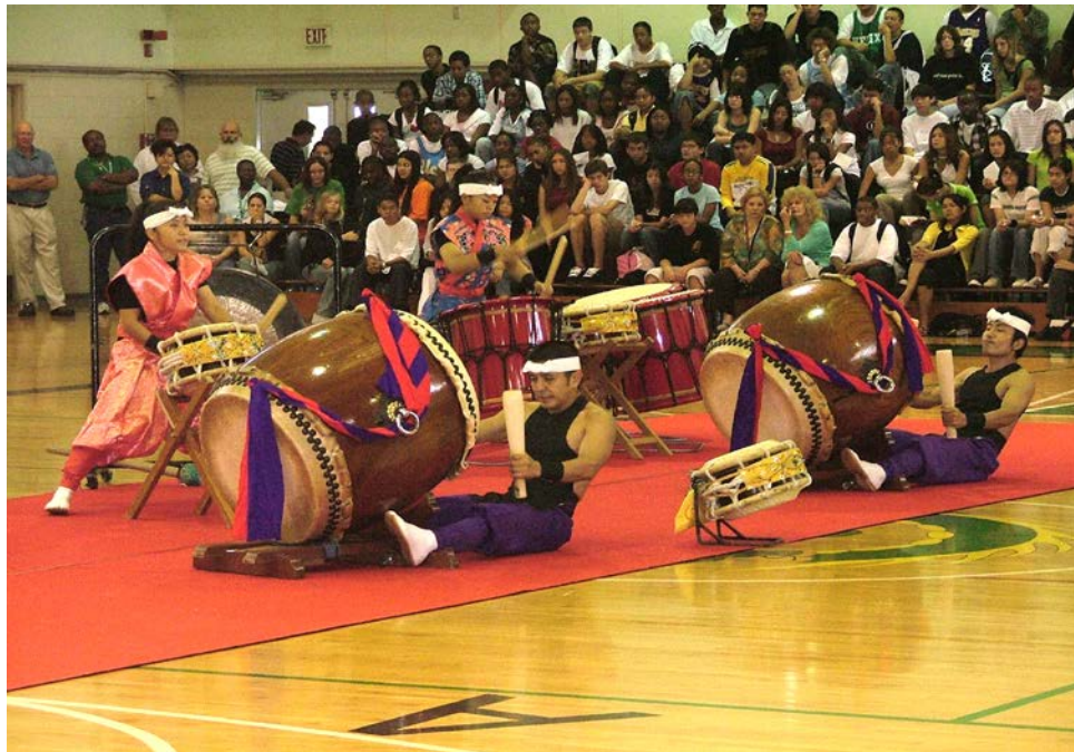
Ringling in the School Year at Kubasaki

The Kubasaki High School community is committed to provide an exemplary education that inspires and prepares all DoDEA students for success in a dynamic, global environment.