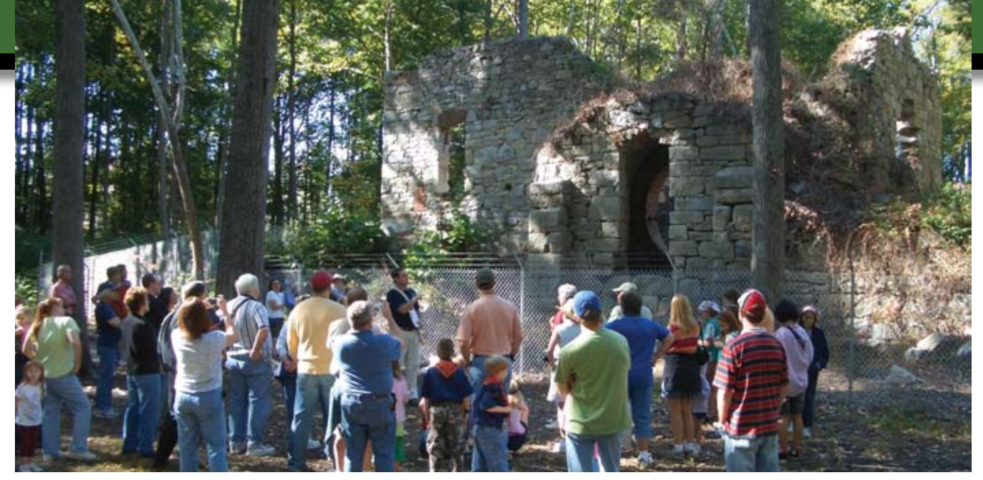
MIDLOTHIAN MINES, CHESTERFIELD, VA