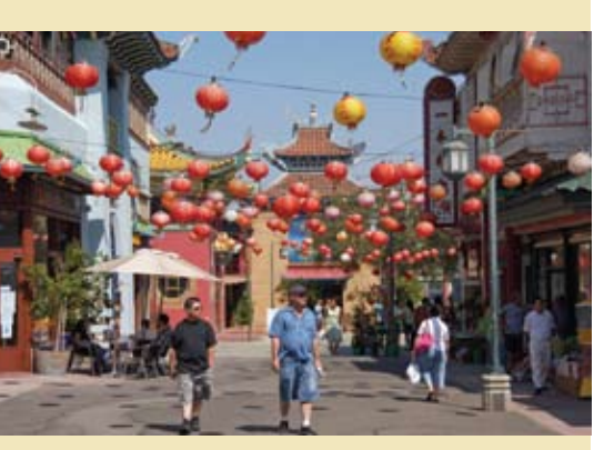
CHINATOWN, LOS ANGELES, CA