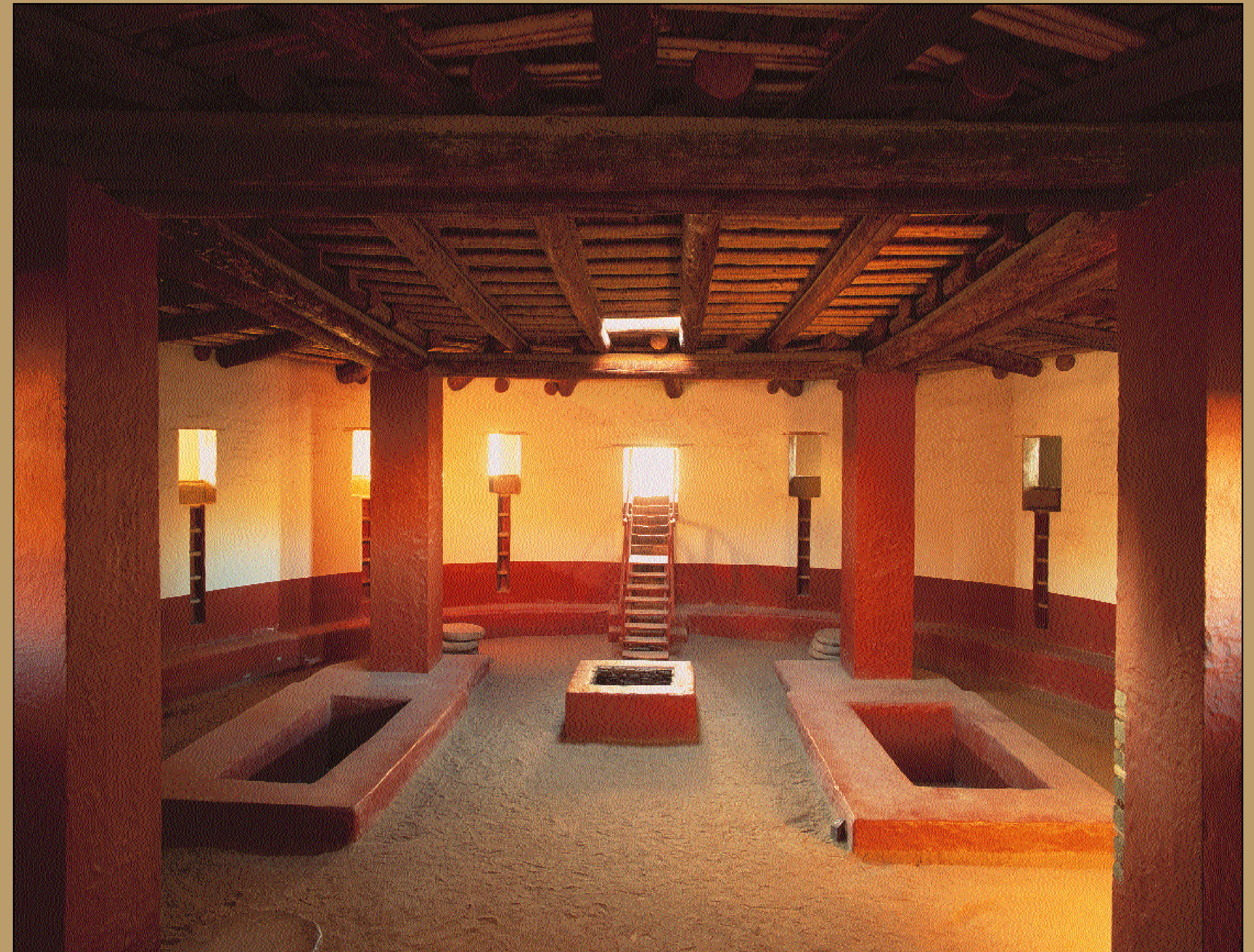
Reconstructed great kiva interior at Aztec Ruins National Monument