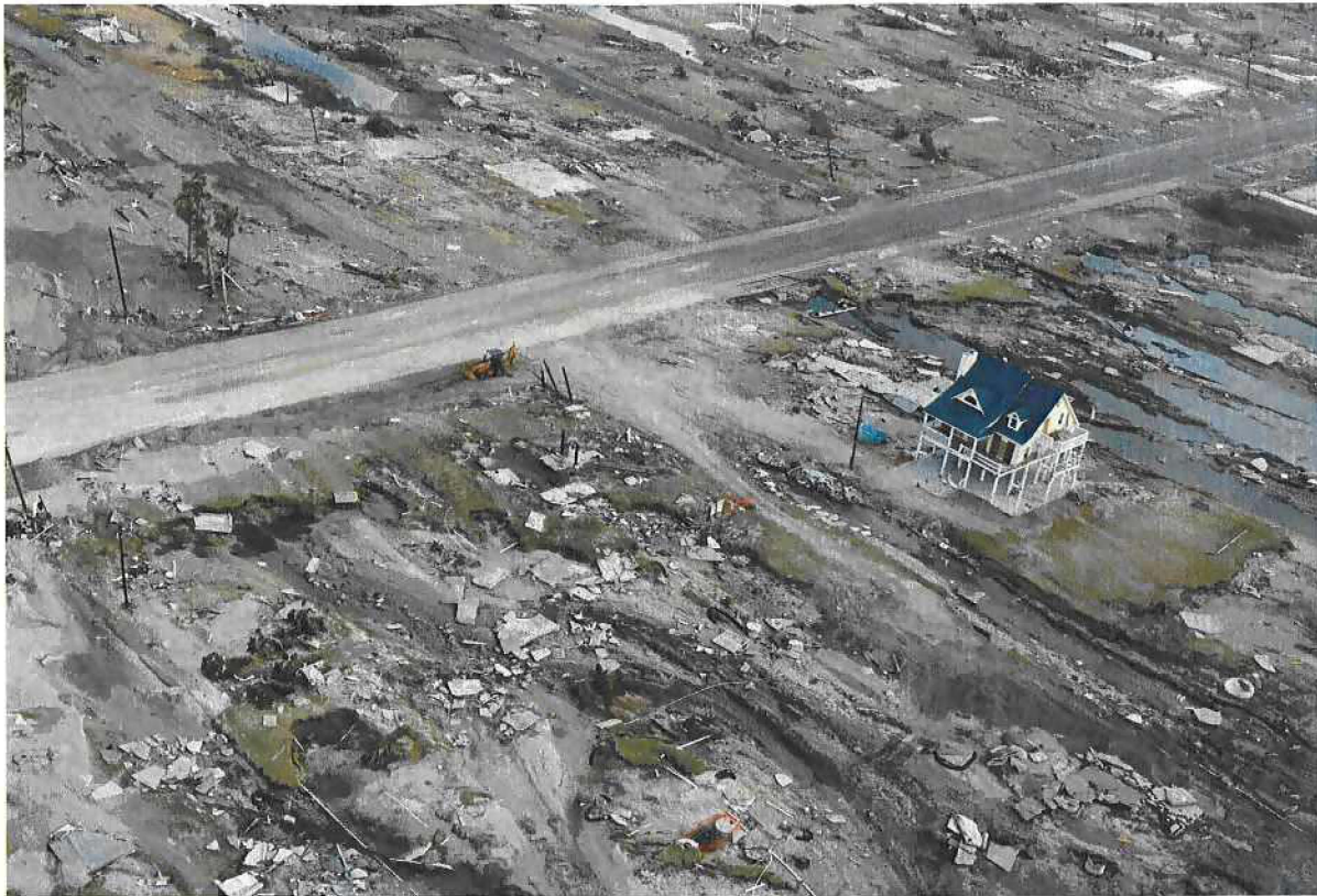
View of the damage Hurricane Ike caused in Gilchrist, Texas in Galveston County.